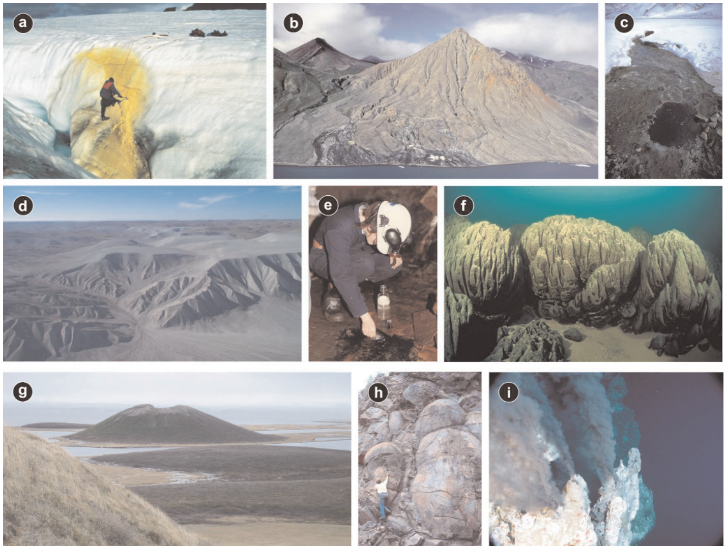
Figure 2. Field photographs of various analogue sites in Canada. a) Native sulfur at the outlet of a spring on the wall of an incised supraglacial melt-water channel, Borup Fiord, Ellesmere Island, Nunavut. b) Colour Peak springs, Expedition Fiord, Axel Heiberg Island, Nunavut. c) Close-up of the Gypsum Hill springs, Expedition Fiord, Axel Heiberg Island, Nunavut. d) Oblique aerial image of the impact melt breccia hills of the Haughton impact structure, Devon Island, Nunavut, showing well-developed gullies and small valley networks. e) Sampling for groundwater geochemistry and gas at seeping borehole at Kidd Creek Mine, Timmins, Ontario. (f) Microbialites in Pavilion Lake, British Columbia. (g) Ibyuk Pingo, Tuktoyaktuk Peninsula, Northwest Territories. (h) Archean stromatolite from the Steep Rock Group, Atikokan, Ontario. i) High-temperature fluid venting from sulfide chimney structures along the Juan de Fuca Ridge.