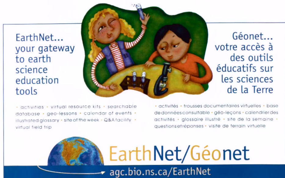
Figure 3 EarthNet, gateway to geoscience education resources.

The Geoscape Canada program, led by the Geological Survey of Canada in partnership with provincial and municipal agencies and educators, communicates practical earth science information to communities across Canada. The program operates on the premise that if we want to show Canadians the usefulness of earth science information, we must explain local geoscience issues that are relevant to them. Canadians want good water supplies, continued access to earth