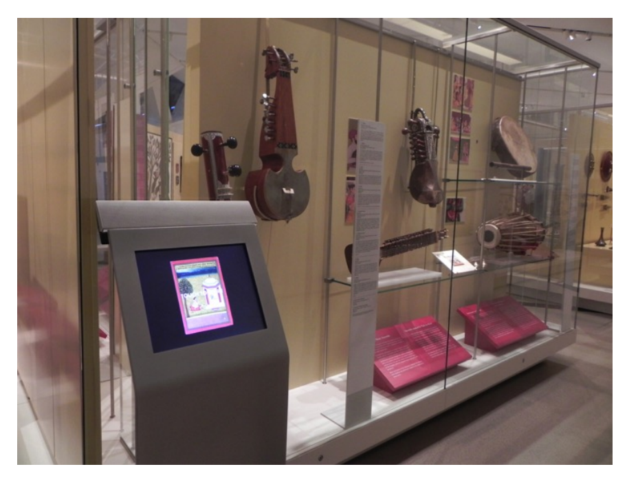
Figure 1. Photograph of musical instrument case and audio kiosk in Ragamala: Garland of Melodies.