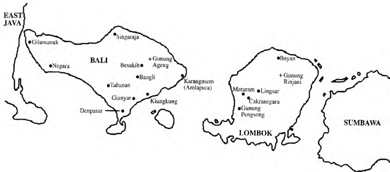
Figure 1: Bali and Lombok