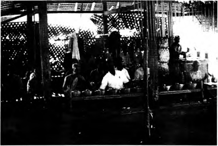
2. The Balinese gamelan gong kuna opens the festival and performs for the duration.

from Karang Ketewel in Lombok worked on the temple, and later were allowed to build their own set of shrines as a reward for their services.