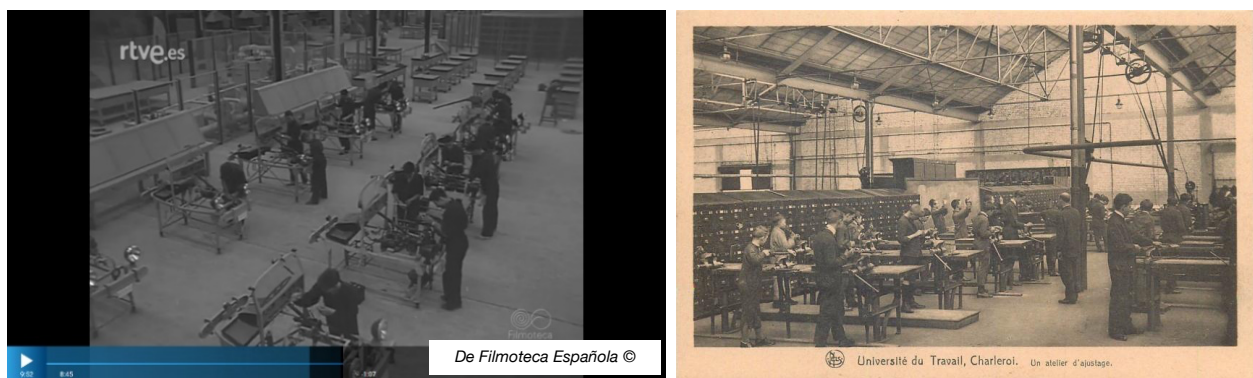
Image 4: Students in workshops (Francisco Franco Labor University in Tarragona and UT).

The voice-over of the Noticiario n. ° 567A (16/11/1953) explained that the Labor University of Zamora 5 had a capacity for more than 600 external and 300 boarding children and had “workshops for carpentry, printing, tailoring, shoemaking, forging and mechanics with modern machinery”. In Noticiario n. ° 695A (30/04/1956) the presenter reported that the José Antonio Primo de Rivera Labor University (Seville) covered a total of 1,078 square meters, was shaped like a fishbone and had a capacity of 6,000 students, although only 500 young people were enrolled in its first year (Documental en Blanco y Negro, Resumen de la Actualidad Española [Summary of Spanish News], 1956, 01/01/1957). The Onésimo Redondo Labor University in Córdoba occupied an area of four million square meters, comprised of six buildings in a cross and each building was a school (Noticiario n. ° 724A, 19/11/1959) (see Image 5). During its first