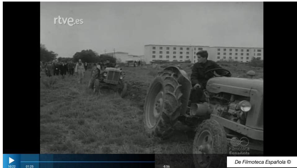
Image 2: Students from the Francisco Franco Labor University in Tarragona in a tractor driver training course.