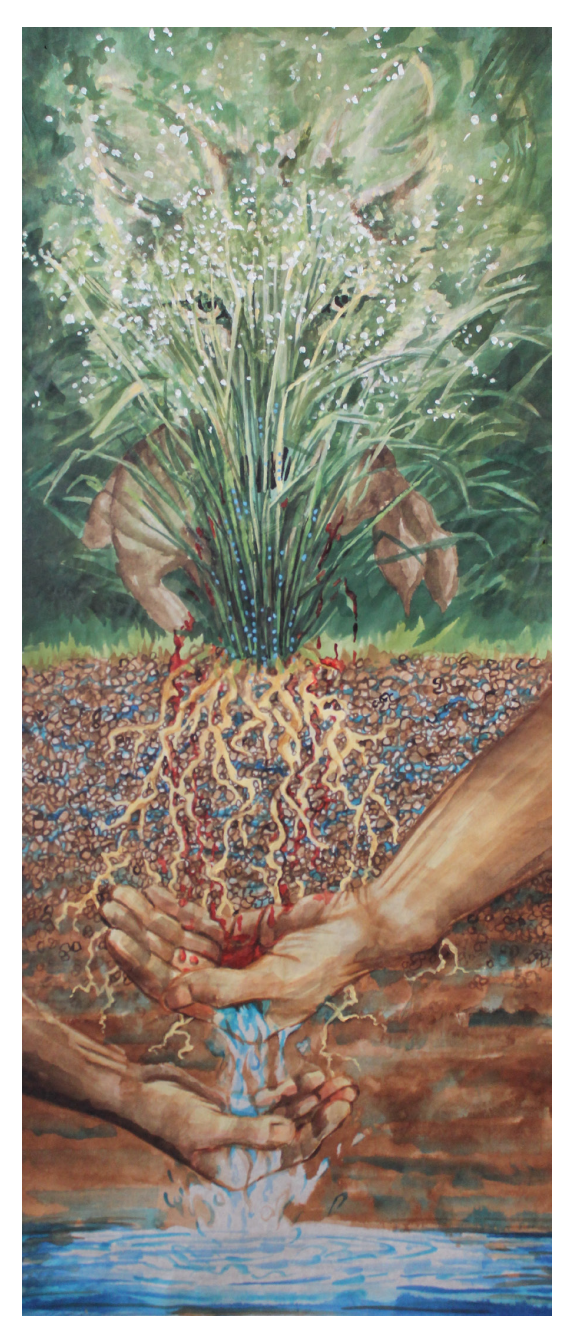
"Filtering" Ink and acrylic paint on Mulberry paper 42"h x 18"w Cheryl Buckmaster (2023)