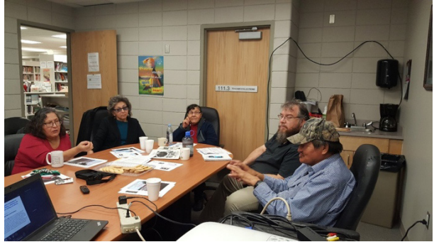
Figure 1. Workshop in Pelican Narrows, Opawikoscikan School Library, October 13, 2018.