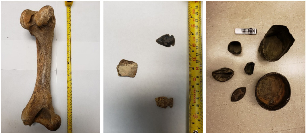
Figure 6. Indigenous artifacts borrowed from communities.

All interviews were recorded with the permission of interviewees by two voice recorders simultaneously. Some interviews were conducted in Cree, while others in English. The oral stories were transcribed by research assistants.