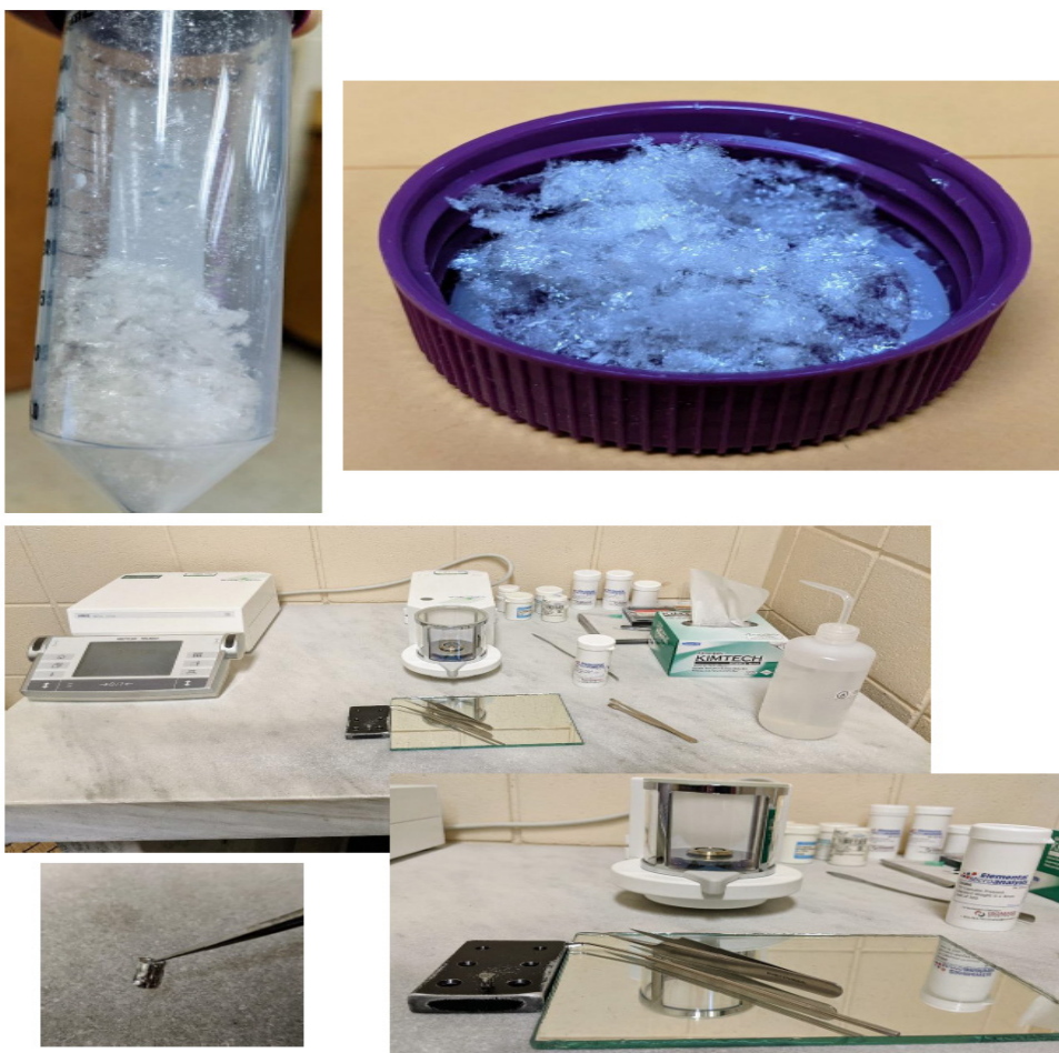
Figure 7. Preparation of bone collagen for isotope analysis. Collagen samples (top) are weighted into 6×4 mm tin capsules ( \approx 0.5 mg per sample).

Carbon and nitrogen stable isotope analyses of bone collagen were conducted in the Saskatchewan Isotope Laboratory at the University of Saskatchewan by Dr. Sandra Timsic (Figure 7).