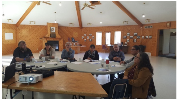
Figure 2. Workshop in Sturgeon Lake, Sturgeon Lake First Nation Healing Lodge, October 22, 2018.