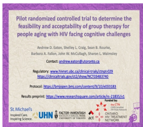
Figure 4. HAND Randomized, controlled trial (RCT)

These projects are part of my overall program of research to develop community-based interventions to address the complexities of living and aging with HIV. As illustrated in Figure 5, I attempt to mitigate such complexities (hospital discharge, cognitive health, and intimate relationships) through the interventions described above. To advance my research program, I assess these studies' results, consider how to adapt, scale, and implement these interventions, and evaluate community engagement. This paper represents a bird's eye view of that community engagement evaluation, where I consider my research program's strengths and limitations, and how my lessons learned can influence the culture of CBPR researchers and investigators considering the use of community engagement techniques in their investigations.