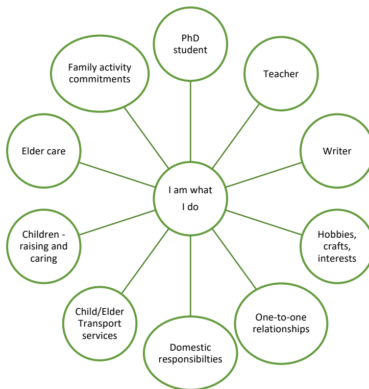
Figure 1. Visual summary of the multiple identities influencing female PhD candidates