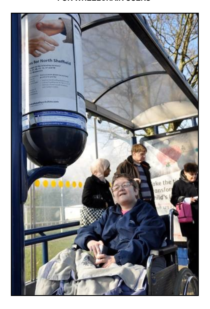
FIGURE 2: PARTICIPANT DIRECTED BUS JOURNEY REVEALING TIMETABLES AT THE WRONG HEIGHT FOR WHEELCHAIR USERS

1994; King and al., 1989). Responsive development of these methods, to include participant produced animation, for example, was facilitated at the request of one of the participant groups. This developed the static narrative of the participants' experiences (captured through their drawings, photographs and words) into a sinuous representation of their person environment interactions.