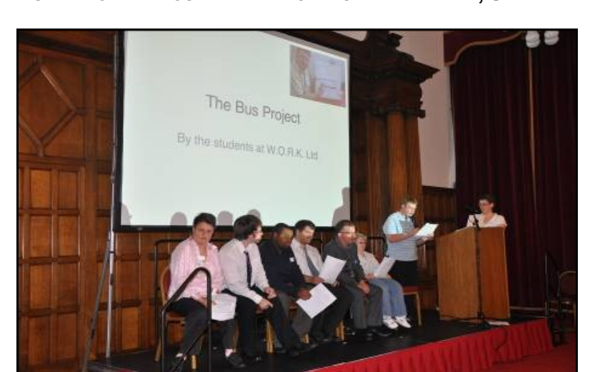
FIGURE 5: PRESENTING FINDINGS AT THE PEOPLES' PARLIAMENT, SHEFFIELD TOWN HALL

One of the driving forces of this project was to achieve positive change in the lives of the participants, but in ways that gave the opportunity for them to experience being actively participant rather than merely a recipient of change. The seven stages of the Experiemic Process places control over what is investigated, how it is done and finally how findings are represented and communicated firmly in the hands of those who have first-hand experience. It achieves this by stripping away the polarization of "expert" and "lay" participants, a familiar characteristic of many participatory methodologies, recognizing instead that all participants are differently expert, either by virtue of special training or by virtue of routine daily experience (Figure 5). Presently, most approaches to decision-making that affects the environments people routinely use are delivered in a top-down manner, in which professional agencies determine process and make master plans for implementation. Even in the more enlightened of these processes where public participation is sought and valued, this remains firmly a part of top-down decision making as local experience is usually extracted from the context and recast as problems requiring professional solution.