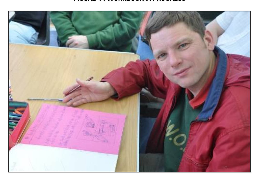
FIGURE 4: WORKBOOK IN PROGRESS

from previous occasions (figure 4). These familiar surroundings gave participants the opportunity to deliver their findings in person in the ways they had chosen for themselves; as an exhibition of canvases, a short drama performance, a presentation of the animation film, and other film and image based materials. An audience of over 150 people, including people with learning disabilities, the local authority and transport providers, attended the event. As a result of this direct communication, which retained the authentic voices of the participant groups, "What's the fuss we want the bus!" recommendations have since been included in the 2010 Sheffield City Council Adult Social Care Mobility Strategy, whilst the transport providers have employed the project DVD as a staff training resource. Through the sharing of experiences, the project has built learning disability community empowerment and cohesion: proof that participation does have a place in affecting policy and practice and that partnership with communities can promote positive change.