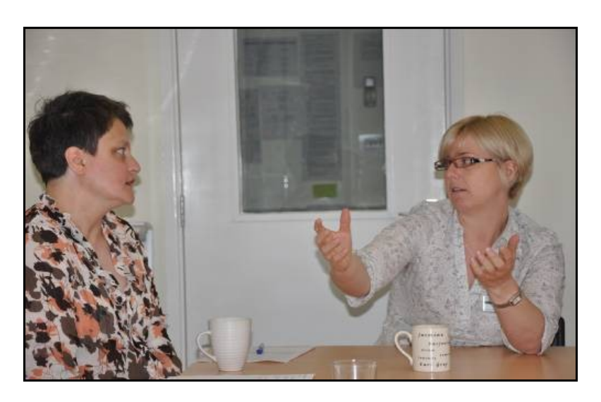
FIGURE 3: SEMI-STRUCTURED INTERVIEW BEING UNDERTAKEN BY A MEMBER OF WORK LTD WITH SHEFFIELD CITY COUNCIL'S MOBILITY STRATEGY OFFICE

An intermediate public project review meeting was held at Sheffield Town Hall to facilitate dissemination of research findings and to obtain feedback from the wider learning disability community, policy makers and practitioners. Following evaluation of this public review, the learning disability participants engaged in a further series of workshops to reveal their aspirational travel experiences, which subsequently formed a basis for engagement with policy and practitioner project partners (Figure 3). Answers to the questions previously identified were sought through semi-structured group discussion workshops. Previous experience orchestrating semi-structured interviews with PWLD revealed the limitations of formal one-toone interview situations, as participants were not comfortable in this setting. The effect of power relations was often in evidence (Cochrane 1998, p. 2123) and pre-prescribed question formats constrained the conversation of the learning disability interviewees (Mathers,