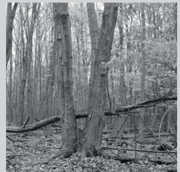
In the forest II, 2017, inkjet print on Washi paper, 76 \times 76 cm

that is less about scale or distancing from nature, and more about connectivity to nature. This longstanding tradition includes the Japanese garden, for instance, which, like Miyazaki's walks through nature, is an interactive yet planned sensory and emotional aesthetic event. The poetry that Miyazaki writes, she says, follows up from the photography and is written later on, after she senses the photographs and the scenes that she captures.