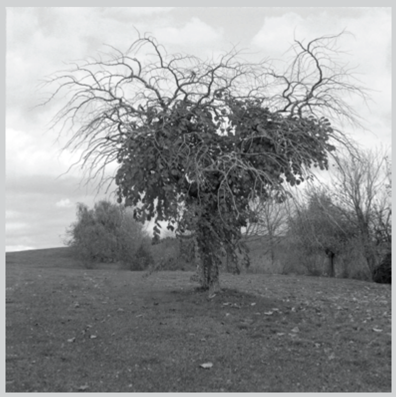
Riddle, 2017, inkjet print on Washi paper, 76 \times 76 \text{ cm}

Galerie d'Este, Montréal November 15-December 10, 2017