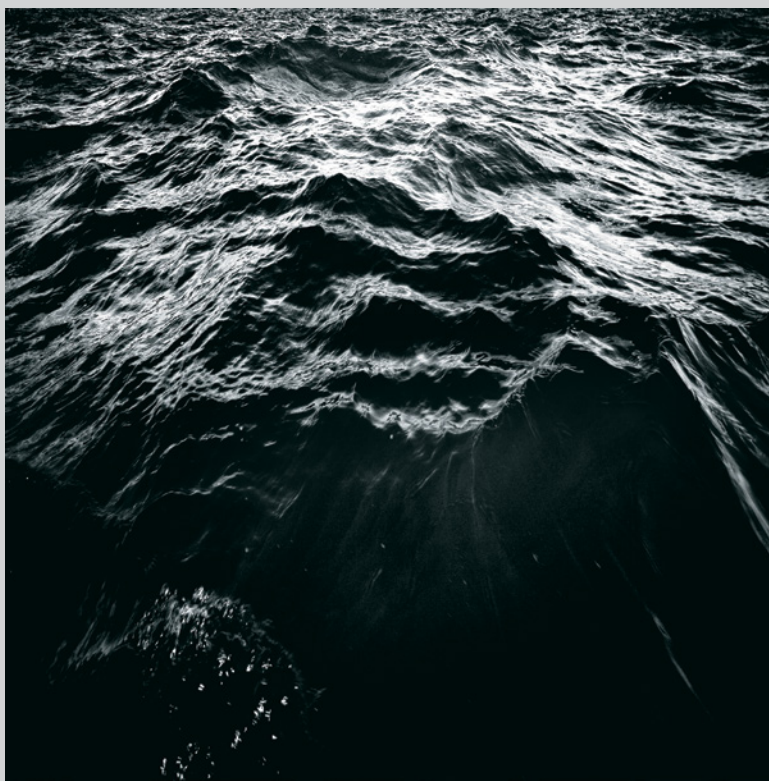
Abysses 2 , from the series PEQUOD ('pi:kwad), 2015, inkjet print on Barite paper, 102 × 81 cm

Lefort’s images seem to have been shot at the helm of a wave-drenched binnacle, with compass and octant close at hand, and all is in a state of irredeemable flux, as the ship pitches and rolls on the face of the deep and fateful cusp of jeopardy that is the open sea. The fact that he is in a kayak and not at the helm of a large sailing ship is not immediately apparent. There seems