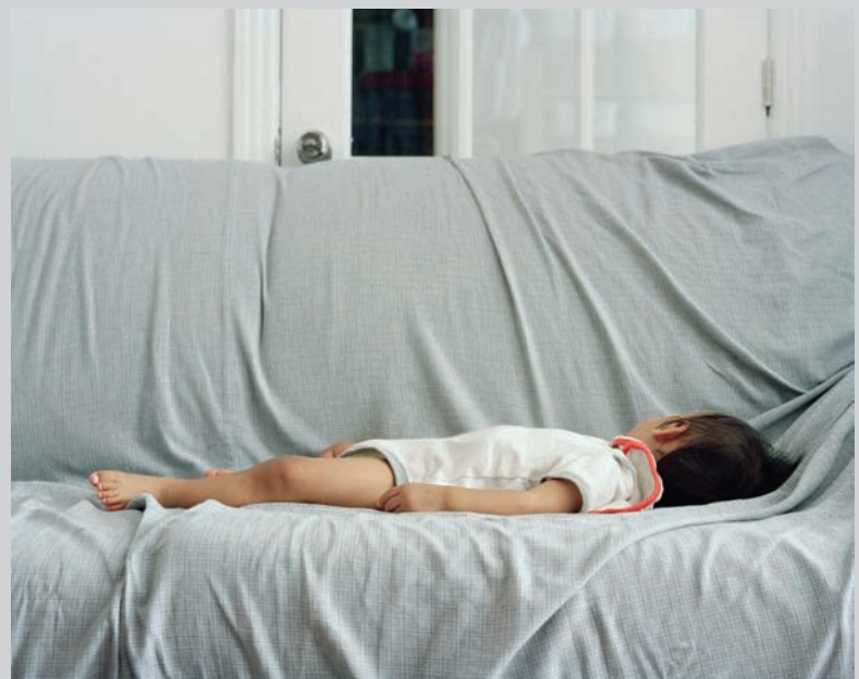
Shaore Lies on Futon , 2011, inkjet print, 101,6 x 127 cm

— James D. Campbell is a writer on art and independent curator based in Montreal. The author of over 100 books and catalogues on contemporary art and artists, he contributes frequently to visual arts publications across Canada and abroad. —