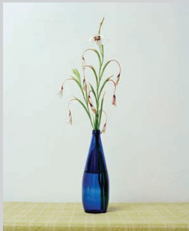
Blue Bottle , 2011, inkjet print, 101,6 x 81,3 cm