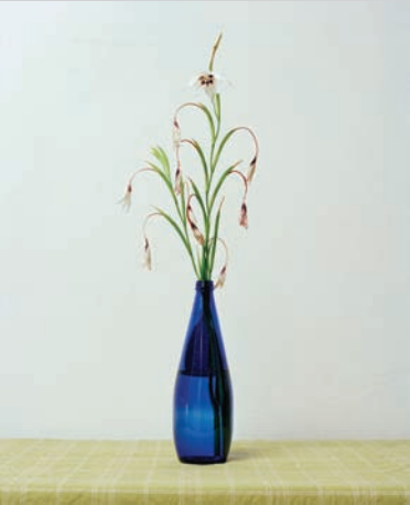
Blue Bottle , 2011, inkjet print, 101,6 x 81,3 cm