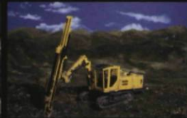
Oil & Gas

Investment Opportunities More About GN Development Group