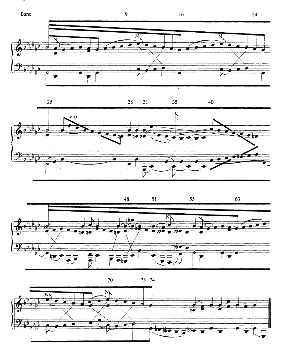
Example 1: Three graphs (X, Y, Z) of Franz Schubert, Impromptu in G-flat Major, D. 899