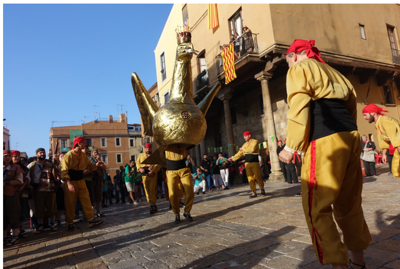
Fig. 2.3. The present-day Tarragonese Eagle dancing in front of Tarragona Cathedral.