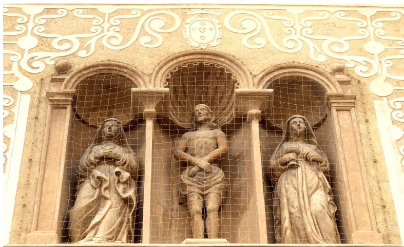
Fig. 2.1. Statue of the Eccehomo placed in the church of Santa Maria de Natzaret above the door to the Plaça del Rei.