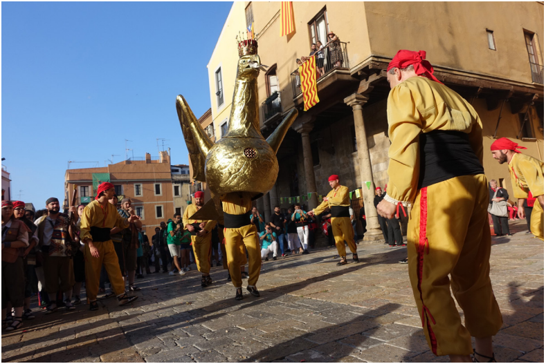
Fig. 2.3. The present-day Tarragonese Eagle dancing in front of Tarragona Cathedral.