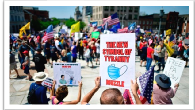
Figure 3.. A demonstrator holds a placard with a face mask stating, “THE NEW SYMBOL OF TYRANNY MUZZLE.” People had gathered outside the Pennsylvania Capitol Building to protest the continued closure of businesses due to the coronavirus pandemic on May 15, 2020 in Harrisburg, Pennsylvania. 110

The discourse of mask as a symbol of rights and freedoms was constructed in opposition to the idea perpetuated with the circulation of the discourse of mask as PPE. The later discourse was deployed in efforts to limit the virus’ spread by appealing to the individual decisions of millions to comply with public health directives to wear masks in public. As bioethicist Nancy Kass, deputy director for public health of Johns Hopkins University’s Berman Institute stated, “masks can be a form of virtue-signaling. By wearing a mask, people show their concern for keeping other people safe.” 42 Habitual mask wearing is constructed as a civic duty in the discourse of face mask, both to protect others and to take responsibility for oneself, especially seen in Eastern Asia cultures, such as China and Japan. An article by the South China Morning Post acknowledged that “wearing face masks is often seen as a collective responsibility to reduce disease transmission and can symbolise solidarity.” 43