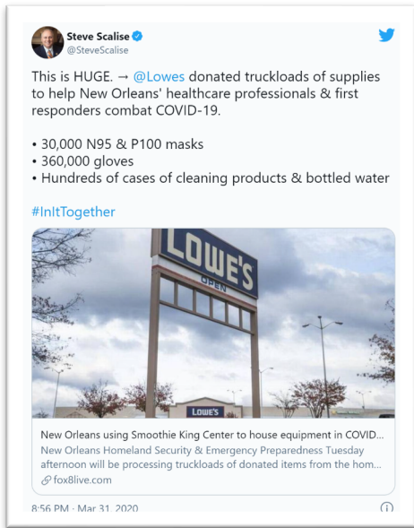
Figure 2 Lowe’s announcing that large shipments of PPE are donated to the HCP. Large corporations such as Lowe’s, Home Depot, and Target donated PPE to the hospitals and first responders.” 31