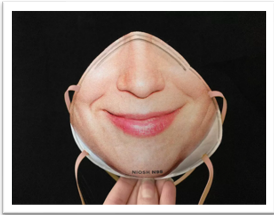
Figure 5. A San Francisco designer created “Resting Risk Face” masks by custom-printing the respirator masks with images of wearers’ faces. It has been advertised as “be protective and be recognized. It’s so easy.” 111

The face and by extension face coverings, have always been constructed with both denotative and connotative meanings related to social communication. 64,65 In North America for example, 66 masks were constructed as barriers to communication during the pandemic because they jeopardized people’s ability to judge facial expressions. 65,66 In contrast, the anonymity offered by face masks was presented as helping people to keep desired social distances in East Asian cultures, 67 where it is perceived as polite and modest not to show obvious emotions. 56,68 Face masks were used to send messages and carry messages throughout the pandemic. A dichotomy of being hidden versus being visible grew out of the face mask as stigma discourse. The common place use of masks in some parts of the world turned it quickly into a popular culture item. For example, Korean and Chinese celebrities often lead public fashion discussions on the face masks they wear. 69,70 Amidst the pandemic and with the broad adoption of masking around the world, face masks emerged as a new genre of fashion accessory, and an expression of personal style, and were sold by all clothing companies. 71 The U.S.-based online marketplace Etsy says its total sales doubled in April 2020, mostly from face mask sales. 72 Masks were also turned into an object for political communication as protestors printed messages on their masks to march in response to George Floyd’s death. 73