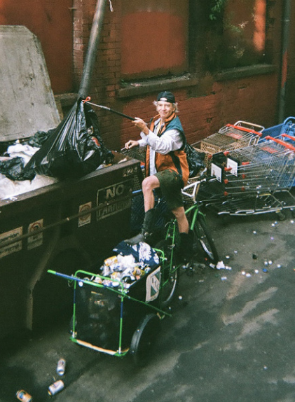
Figure 1. Photovoice participating binner showing how he believes people find him threatening, then demonstrating how he uses the threatening tool for use in dumpsters