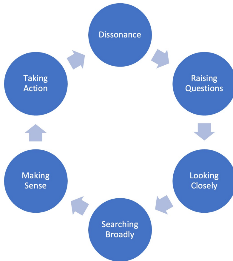
Figure 1. Circle of Inquiry (Pincus, 2005)