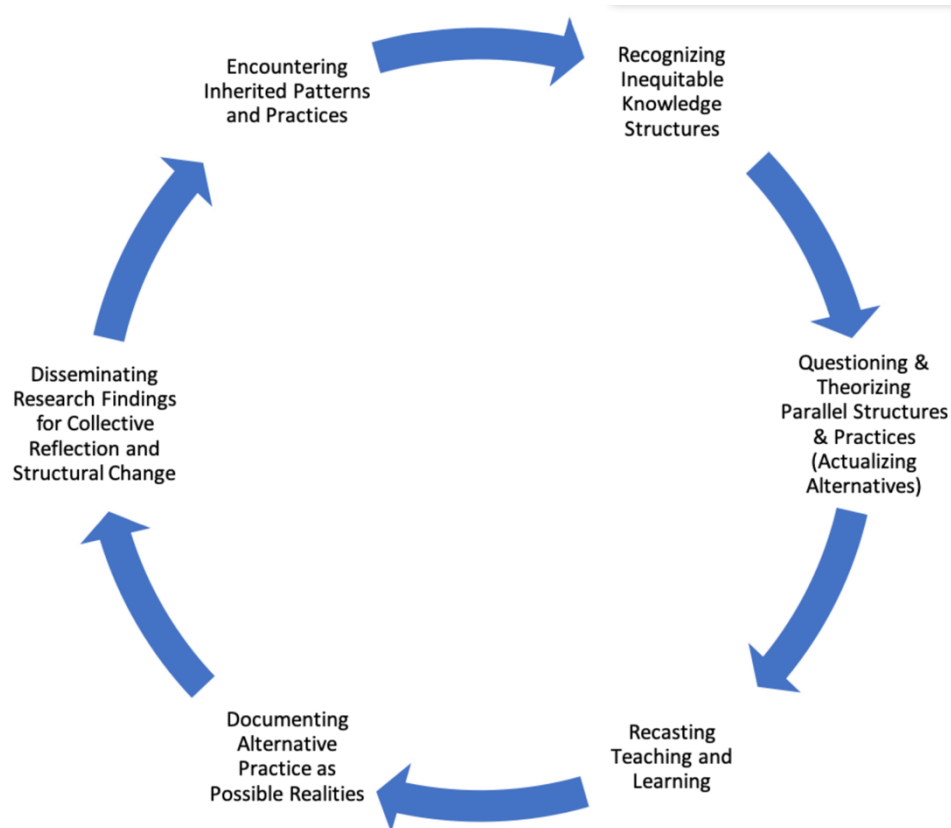
Figure 3: The Structured Model of Practitioner Inquiry

“Teacher research is a form of inquiry approached from the teacher perspective” (Craig, 2009, p. 61). Theories that conceptualize practitioner and action research often value teachers’ epistemic privilege and thus resist hierarchies of knowledge that reduce the role of practitioners to technicians that need to follow roadmaps created by academic and policy makers. “School-based teacher researchers are themselves knowers and a primary source of generating knowledge about teaching and learning for themselves and others” (Cochran-Smith & Lytle, 2009, p. 447). Action research, as a form of practitioner inquiry, additionally, emphasizes the significance of taking “action” based on teachers’ epistemological stance. Teachers can “make up their own minds about how to change their practices in light of their informed practical deliberations” (Carr & Kemmis, 1986, p. 219).