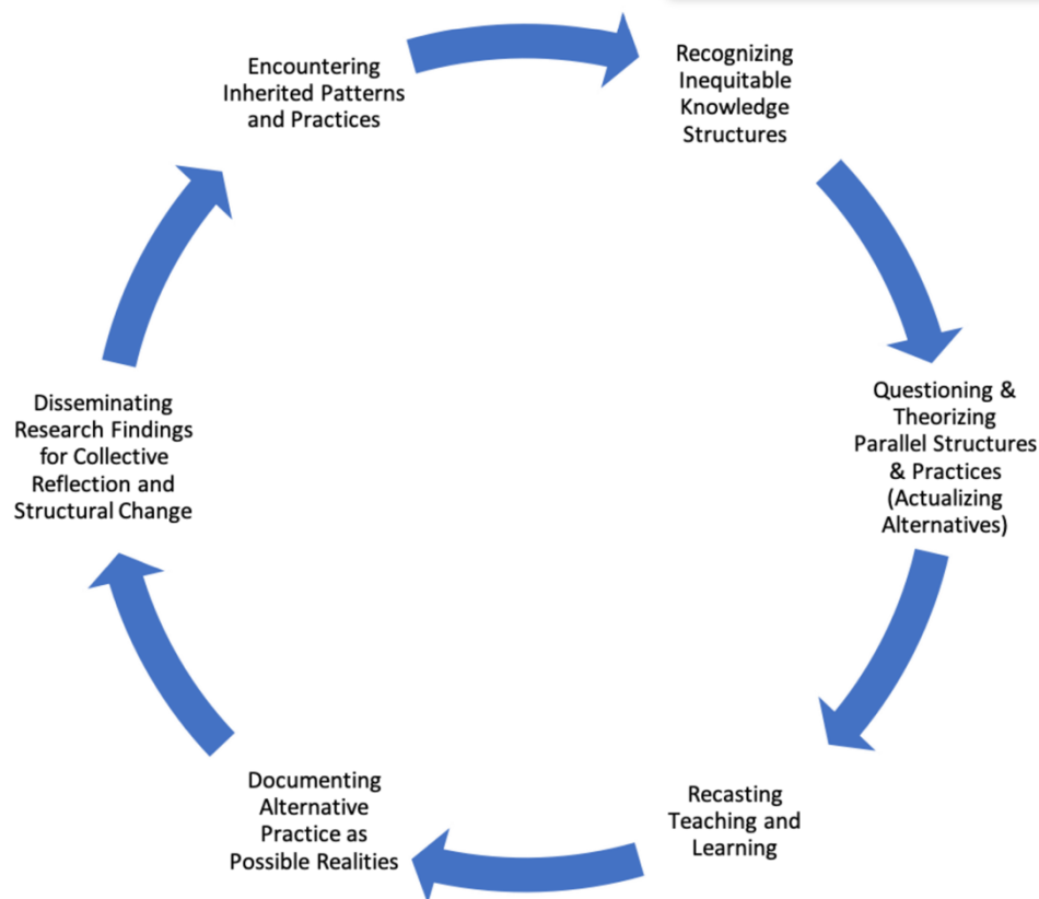
Figure 3: The Structured Model of Practitioner Inquiry

“Teacher research is a form of inquiry approached from the teacher perspective” (Craig, 2009, p. 61). Theories that conceptualize practitioner and action research often value teachers’ epistemic privilege and thus resist hierarchies of knowledge that reduce the role of practitioners to technicians that need to follow roadmaps created by academic and policy makers. “School-based teacher researchers are themselves knowers and a primary source of generating knowledge about teaching and learning for themselves and others” (Cochran-Smith & Lytle, 2009, p. 447). Action research, as a form of practitioner inquiry, additionally, emphasizes the significance of taking “action” based on teachers’ epistemological stance. Teachers can “make up their own minds about how to change their practices in light of their informed practical deliberations” (Carr & Kemmis, 1986, p. 219).