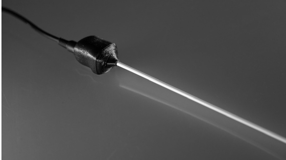
FIGURE 1 The Haptic Baton/Buzz Beat System by Human Instruments.