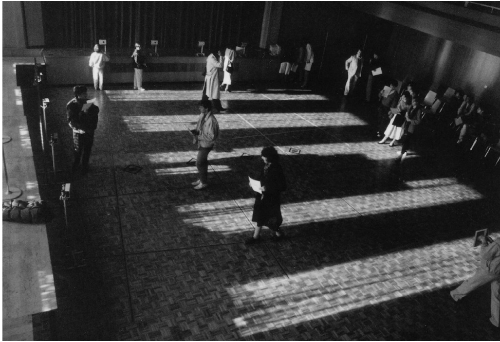
FIGURE 2 SOUND=SPACE installation and diagram.