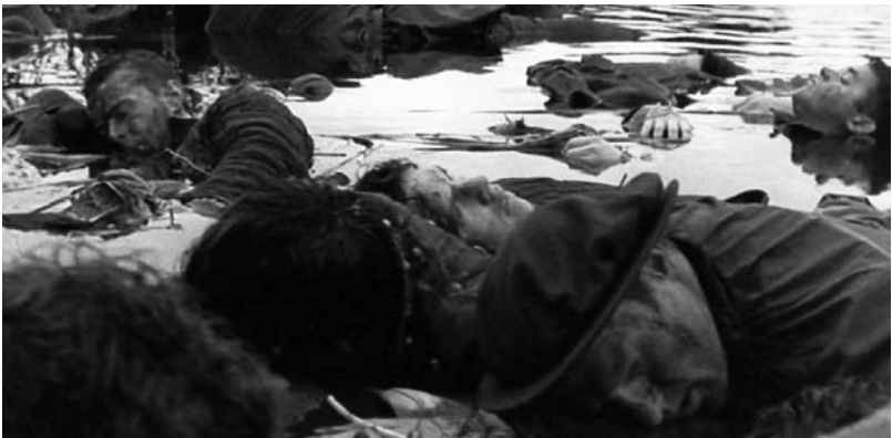
A river runs red with blood in a Scottish battlefield. Elizabeth (Shekhar Kapur, 1998).

With a bold aesthetics of saturated colours, vertiginous camera angles and rapid editing, Elizabeth destabilizes the mythic account of the peace and harmony of the Elizabethan period. Highlighting the uncertainty of the young queen’s rise to power, Kapur uses a cinematic language of corporeal intensity to