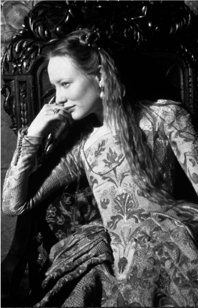
Cate Blanchett incarnates the young, modern Elizabeth. Elizabeth (Shekhar Kapur, 1998).

politic). Central to Elizabeth and its sequel Elizabeth: The Golden Age (Shekhar Kapur, 2007) is the tension between personal desire for love and strict state control of the queen's body. This tension can be seen in the scene after the coronation, when the young queen halts all of the proceedings to declare: "Play a volta!" A space is cleared in the middle of the ballroom and a ritual dance takes place with the camera spiralling around the couple. Intercut with reaction shots of the crowd, the