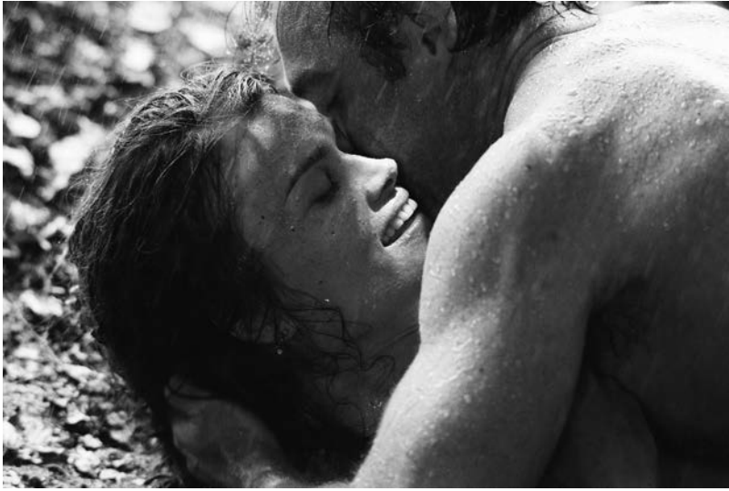
Constance and Parkin make love in the rain: a problematic natural order. Lady Chatterley et l'homme des bois (Pascale Ferran, 2006).

s'inventer un monde habitable" (quoted in Lequeret 2006, p. 11). Near the end of the film, the lovers cavort naked in the driving rain, make love in the mud and adorn one another with flowers; this sequence implies a pristine natural order where sexuality has the liberatory power to break down social hierarchies. This seemingly naturalistic filmic sexuality framed through a female point of view struck a favourable chord with many critics; for instance, both Ferrari (2006) and Burdeau (2006) praised the film's unusual portrait of sexual "tenderness."