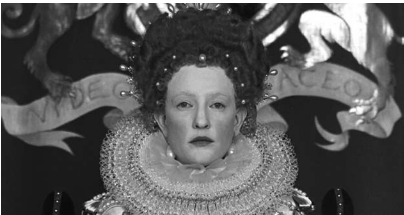
Elizabeth transformed into Britannia at the end of the film. Elizabeth (Shekhar Kapur, 1998).

Comolli's account of the competing bodies in historical fiction brings into relief the corporeal generic coding of gesture, costume and performance. Blanchett enacts the princess's