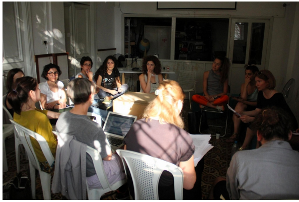
Figure 1: Reading group at 98Weeks.