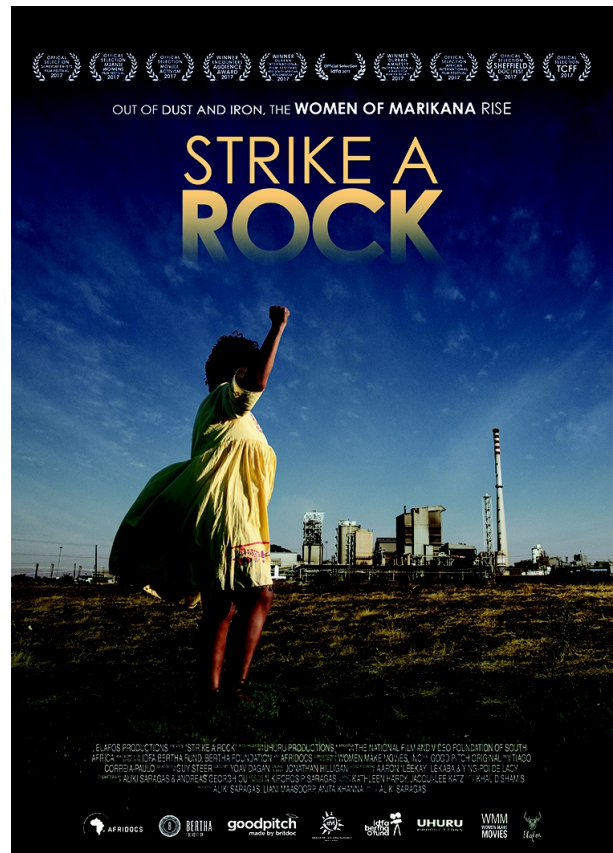
Figure 3: Poster for the film Strike a Rock . Director Aliko Saragas

volved a strong workers’ movement and internationalist accents during the 1980s.