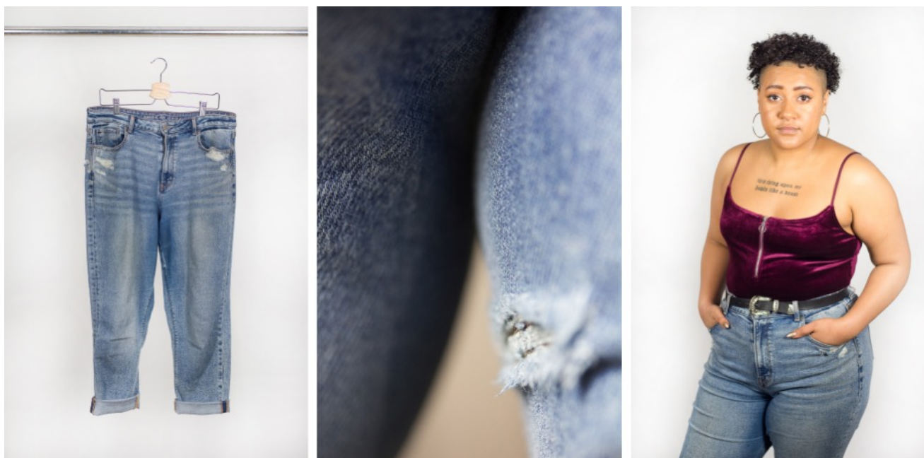
Triptych of participant Jade

Note: A row of three images. From left to right: A photo of Jade’s faded blue jeans, with the hems cuffed and slight tearing underneath the front pockets, hanging from a wooden clothes hanger. The hanger is attached to clear fishing line beneath a silver metal rod, so it appears to be levitating in mid air. The background is white.