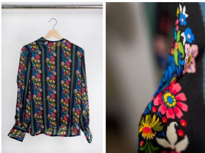
Diptych of Alexei's top

Note: From left to right: A photo of Alexei’s floral and striped shirt hanging from a wooden clothes hanger. The hanger is attached to clear fishing line beneath a silver metal rod, so it appears to be levitating in mid air. The background is white. An extreme close-up photo of Alexei’s outfit, with multicoloured flowers printed on a black background, cascading down the right side of the frame. A blank white space is where a portrait of Alexei would appear as they were not able to attend an in-person photo session.