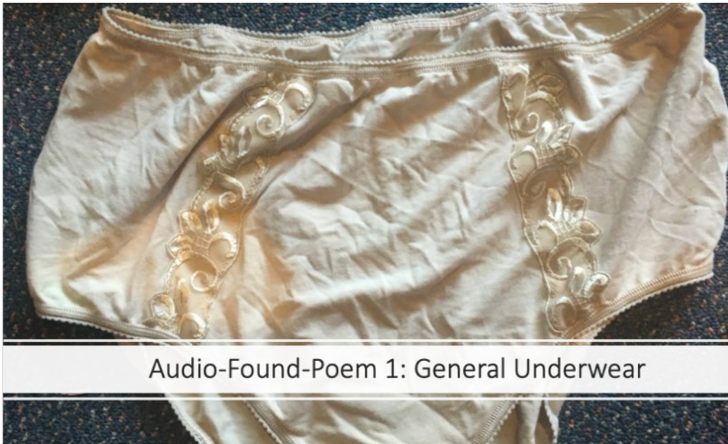
Audio-Found-Poem 1: General Underwear

Practical Underwear.