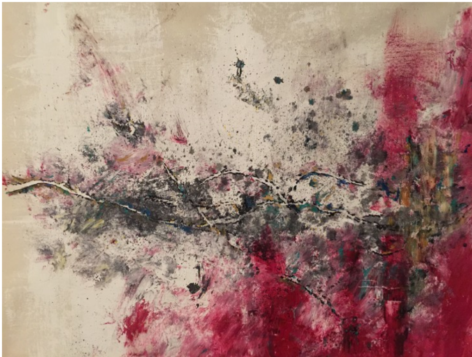
Figure 2 The Schizo Considers Academic Timelines?

Note: An abstract painting on raw canvas. Bright crimson originating in bottom right hand corner extends upward and sideways. Muddied spots of black ink, and grey, mustard, and teal paint overlay the crimson. A series of curved black lines extend horizontally across the centre of the painting, intersecting, and weaving. Smudged grey and black ink spots dot the canvas.