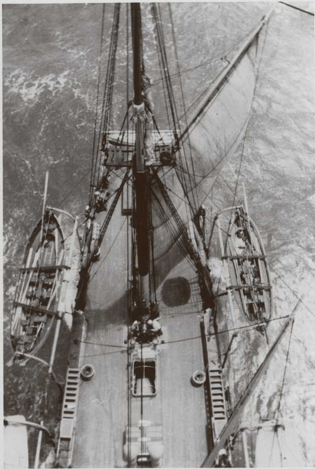
FIGURE 3 Photograph by Van Horne Morris with caption on the back that reads, "The Nantucket, 1937." Source: Personal collection of the author.