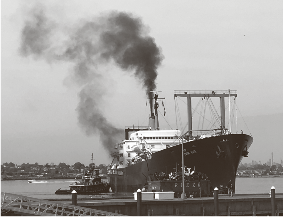
FIGURE 1 SUNY Maritime College's Empire State VI training ship, departing for summer sea term, May 2018.

In order to better understand these collections, in 2017, I enrolled in the college's graduate program in maritime and naval studies, which offers courses in maritime literature, history, music, and art. Through my coursework in the program, I began to make connections between primary sources in the archives and the tradition of American sea writing. When it came time to design my graduate capstone project, I decided to pursue a digital humanities project, transcribing and annotating first-hand accounts of maritime life. In order to contextualize these writings, I had to first understand the evolution of literary culture among sailors in the United States.