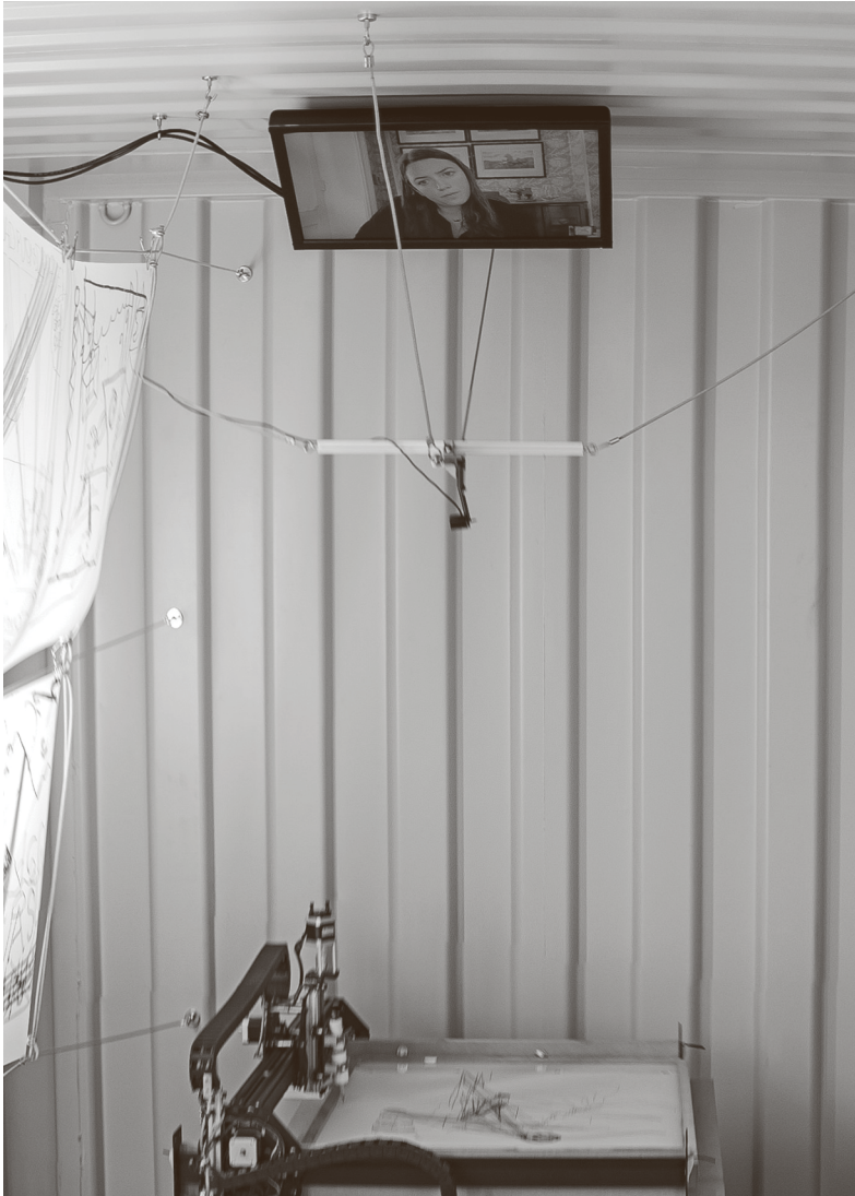
FIGURE 2 Installation shot of Paper-Thin v3, 2018. HubWeek Festival, Boston, MA.