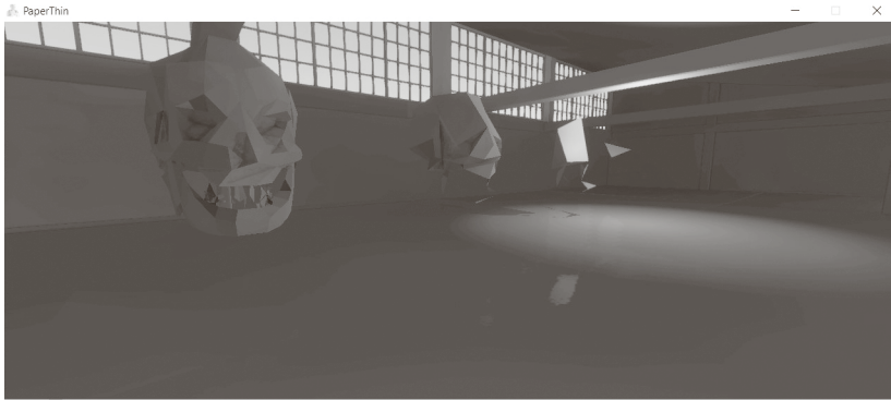
FIGURE 4 Hugo Arcier, Degeneration I , 2007. Virtual reality, dimensions variable. Paper-Thin v1 , accessed December 22, 2020, https://paper-thin.org/ .

negotiating the mess of migrating across disparate 3-D modelling software environments, Buckley and Smith created a skeleton virtual exhibition space in Unity for v2 and shared this, along with documentation, with all the participating artists to ensure that they contributed works compatible with the environment from the outset. This documentation begins with a line that some archivists might wish to adapt and include in communications with donors of digital materials: “We’re neat freaks because the project breaks if we don’t have common organization between all artists. Please bear with us, and follow the rules below.” 72 This gradual honing of a curatorial skill set and approach resonates with Abigail De Kosnik’s description of the crucial “amateur” archival labour that sustains online fan-fiction archives. As De Kosnik suggests, these repertoires for digital curation – the actions and coordinated activities of community curators driving processes of cultural production – may be the aspect of digital culture that becomes codified and preserved over time, even as specific technologies become obsolete and particular cultural objects become inaccessible. 73