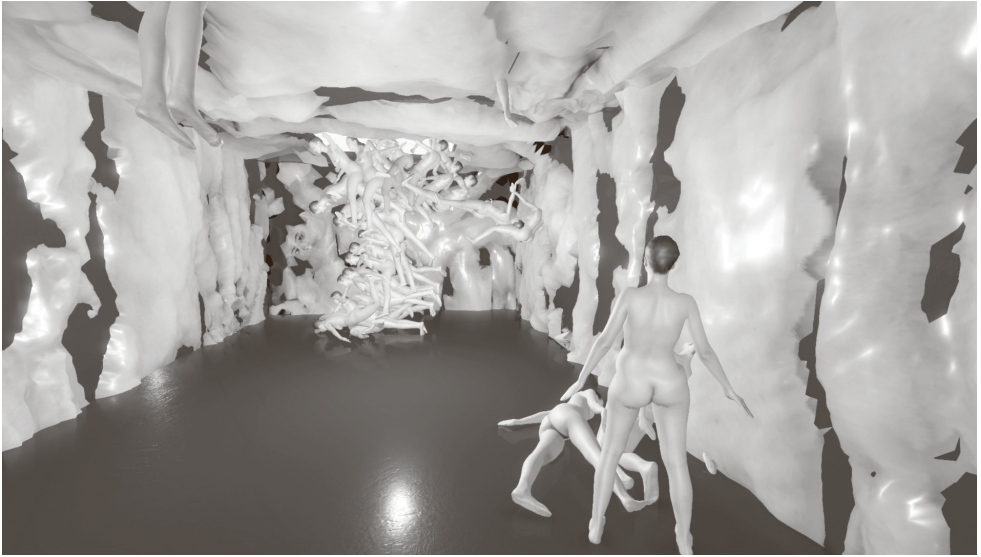
FIGURE 5 Martina Menegon, I'll Keep You Warm and Safe in My People Zoo, 2016. Virtual reality, dimensions variable. Paper-Thin v2, accessed December 22, 2020, https://paper-thin.org .

Cook outline, festivals like Ars Electronica 78 and media labs like V2 79 form bridges between artistic and technological methods of cultural production that expressly leverage this inherent interdisciplinarity of new media art. 80 As an artist-run platform for experimenting with new technologies, Paper-Thin fits within this larger history of digital art curation. However, an exceptional aspect of Buckley and Smith's curatorial practice is their commitment to maintaining artists' contributions to the platform well after the point of exhibition. Both aspects of Paper-Thin – as a space for artistic experimentation and as an archives of that activity – are integral to the conceptualization of the project and are reflected in Buckley and Smith's digital-curation efforts, which extend beyond the co-construction of the platform.