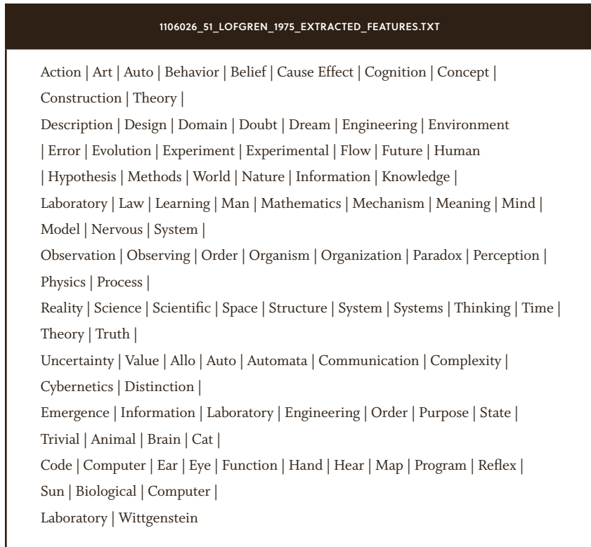
FIGURE 1 Extracted entities from Heinz von Foerster's correspondence.

While the N-grams still contained a great deal of noise, especially frequencies of words that did not appear germane to cybernetics, some cybernetic terms that appeared frequently together (e.g., neuron , impulse , measure ) did surface. After removing stop words, the programmer used the cybernetic terms/inputs to further refine the list of entities to be used in the machine-learning phase to classify the documents. The next step was to extract entities that include these cybernetic terms and the names of associated persons, such as individuals mentioned in the documents (figure 1).