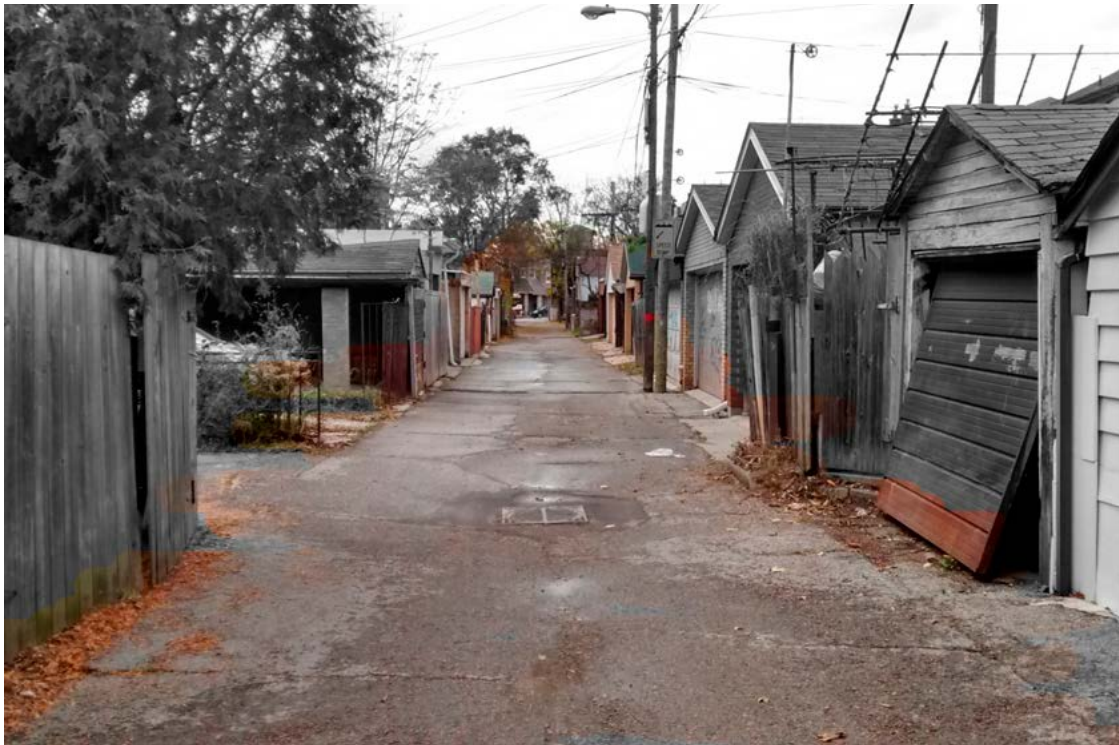
Figure 3. Toronto, Victor Jara Lane, 2015.