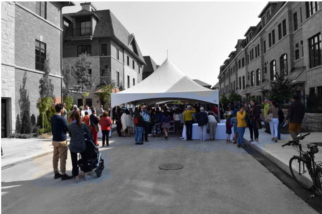
Figure 8. Toronto, unveiling event of the Salvador Allende Court, 2017.