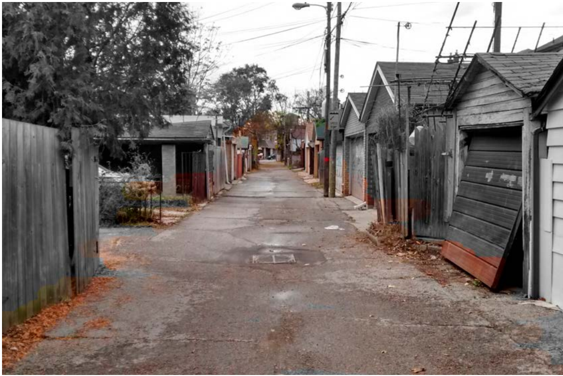
Figure 3. Toronto, Victor Jara Lane, 2015.