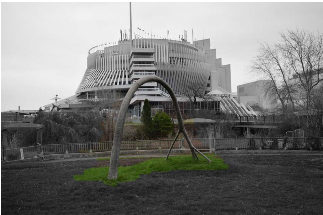
Figure 6. Montreal, L'Arc and the city's casino, 2017.