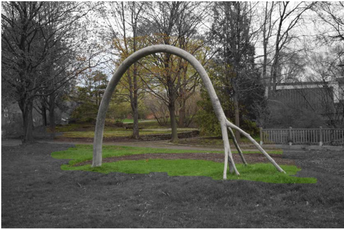
Figure 5. Montreal, L'Arc, 2017.