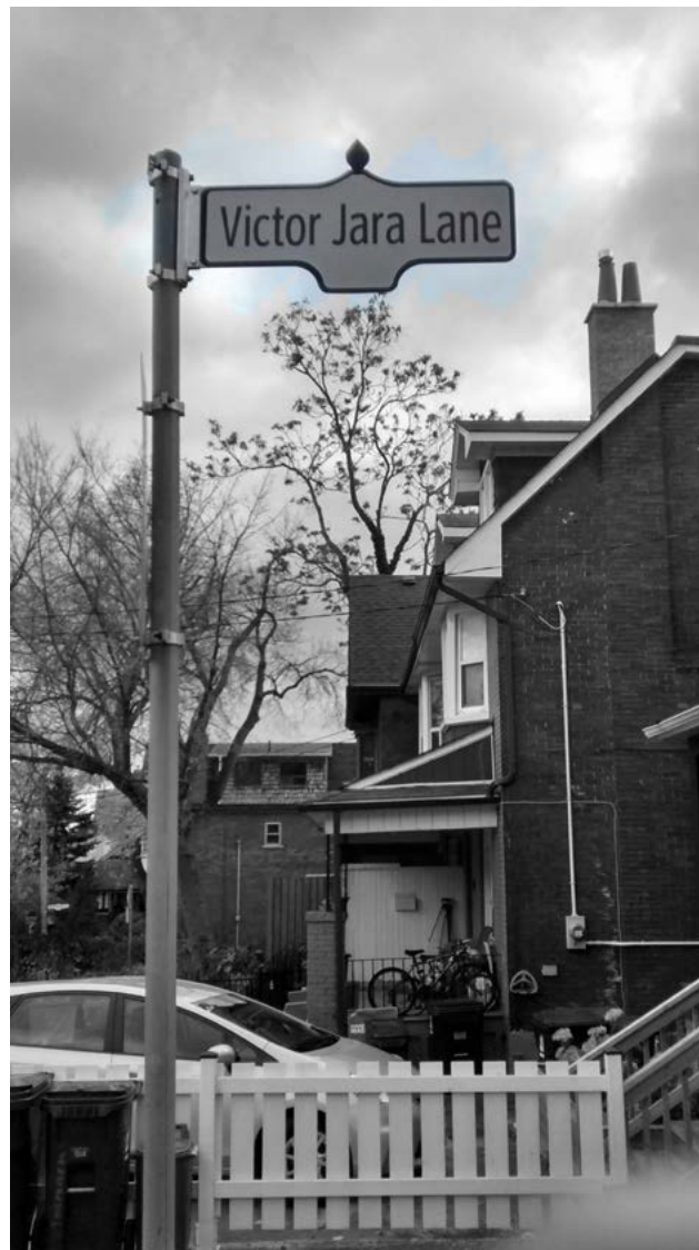
Figure 2. Toronto, Victor Jara Lane, 2015.

On this date, a new street name is unveiled in Toronto that bears the name of a Chilean individual. Located in the Davenport neighbourhood, the new Victor Jara Lane is not remarkably different from the other alleys in the area (see Figures 2 and 3). Victor Jara was a popular Chilean musician, poet, and cultural manager assassinated two days after Augusto Pinochet's coup d'état . The naming of the lane was part of an artistic initiative fostered by the Latin American Canadian Art Projects (LACAP) 4 association to commemorate Latin American artists and cultural characters. LACAP presented the project to the local government, which authorized it in adherence to the city administration's public policies that encouraged the expression of cultural diversity.