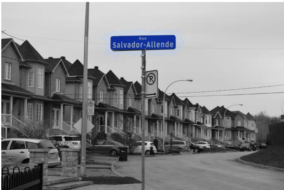
Figure 1. Laval, Salvador Allende Street, 2017.

Four years after Pinochet's release from London, the Laval city administration in Quebec confirmed that one of its streets would bear the name of Salvador Allende 3 , the former Chilean president overthrown by the Pinochet coup (see Figure 1). An odonym is a name associated with a communication route such as a street, an alley, or an avenue. Its importance for postcolonial, urban, and critical toponymy studies is well known (Azaryahu 1996; Berg and Vuolteenaho 2009; Bouvier and Guillon 2001; Casagrande 2013). As Dominique Badariotti has explained, "it must be noted that it is not insignificant to baptize a street 'Joan of Arc,' a square 'Salvador Allende,' or to give names of European cities to an entire district" (Badariotti 2002, 285–286) (my translation). Urban odonyms provide symbolic landscapes within urban spaces and give meaning to places. Thus, I can understand a city's past and present through its odonyms because they bear traces of successive evolutions, extensions, and urban development (Badariotti 2002). Seeing the panel with Allende's name on it in a residential (and relatively wealthy) neighbourhood in the suburbs of Laval, it seems strange to me to think that the odonyms could express the aspirations of their communities in providing what Don Mitchell (2003) has referred to as "the right to the city." Nevertheless, the odonym proves to be a good starting point for the project.