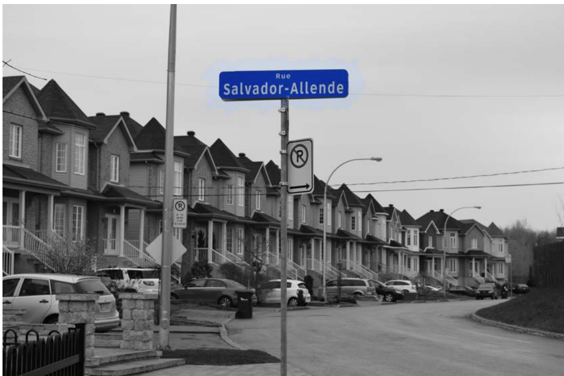
Figure 1. Laval, Salvador Allende Street, 2017.

Four years after Pinochet's release from London, the Laval city administration in Quebec confirmed that one of its streets would bear the name of Salvador Allende 3 , the former Chilean president overthrown by the Pinochet coup (see Figure 1). An odonym is a name associated with a communication route such as a street, an alley, or an avenue. Its importance for postcolonial, urban, and critical toponymy studies is well known (Azaryahu 1996; Berg and Vuolteenaho 2009; Bouvier and Guillon 2001; Casagrande 2013). As Dominique Badariotti has explained, "it must be noted that it is not insignificant to baptize a street 'Joan of Arc,' a square 'Salvador Allende,' or to give names of European cities to an entire district" (Badariotti 2002, 285–286) (my translation). Urban odonyms provide symbolic landscapes within urban spaces and give meaning to places. Thus, I can understand a city's past and present through its odonyms because they bear traces of successive evolutions, extensions, and urban development (Badariotti 2002). Seeing the panel with Allende's name on it in a residential (and relatively wealthy) neighbourhood in the suburbs of Laval, it seems strange to me to think that the odonyms could express the aspirations of their communities in providing what Don Mitchell (2003) has referred to as "the right to the city." Nevertheless, the odonym proves to be a good starting point for the project.