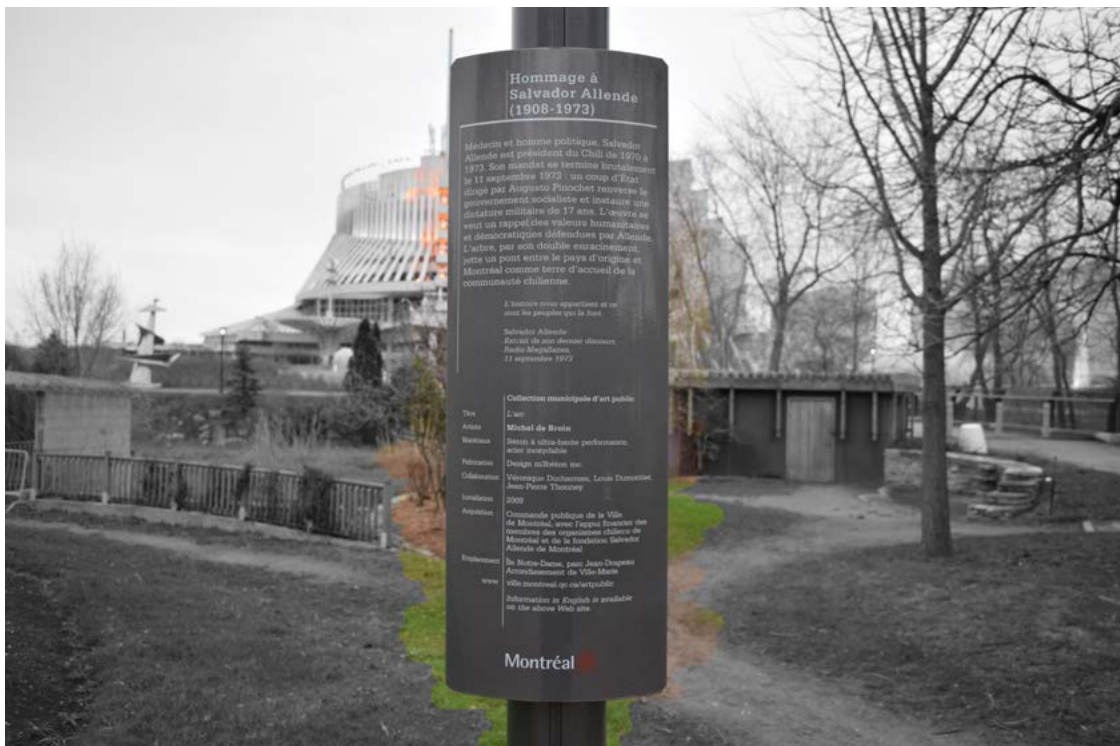
Figure 4. Montreal, commemorative plate in Jean Drapeau Park, 2017.

how they engage with its scattered material world and the past anchored within it. Located in the symbolic Jean Drapeau Park, L'Arc is not only artwork of the past but also an artifact for the future because it provides a sense of belonging to Chilean immigrants. As some interviewees emphasize, the political practices preserve the past or at least a part of it. I argue that the feeling of belonging emerges less through commemorating an event of the past than through participating in the historical trajectory of the commemoration process itself. This interpretative turn allows some Chilean exiles to acknowledge urban artifacts as the materialization of an active agency of spatial appropriation and not simply as monuments that memorialize passive victimhood of a traumatic and overwhelming event. Healing situates itself in part in that turn, where the experience of exile is a continuous “process of becoming” (Deleuze and Guattari 1972), folding the past and the present (Robb 2020). Here also lies the multitemporality of L'Arc—the timelessness of the concrete and steel rods and the transience of the wood of the trees.