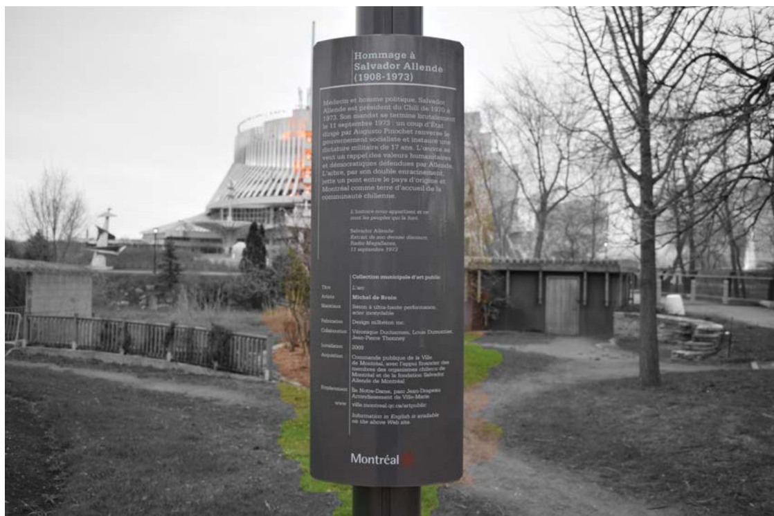
Figure 4. Montreal, commemorative plate in Jean Drapeau Park, 2017.