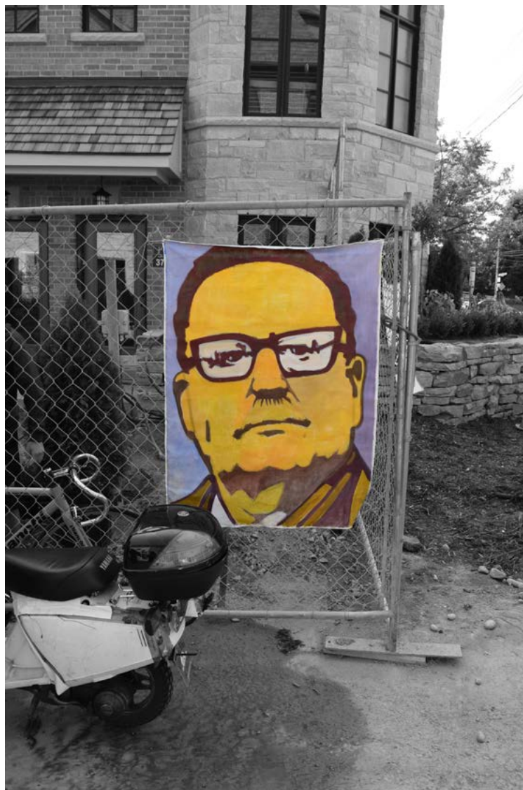
Figure 12. Toronto, unveiling event of the Salvador Allende Court, 2017.

or Montreal, urban artifacts triggered a connection to a community I did not know existed (see Figure 12). The examples presented here lead me to reflect on concepts related to odonyms and public art as significant urban artifacts, exiled immigrants as dynamic configuring agents of the symbolic urban landscape, and contemporary materialities as possible urban spaces of symbolic healing. I approached them, hoping to add a more nuanced view to commonly used sociological categories, such as immigrants. Joan Simalchik rightly noted that Chilean exiles “were not immigrants seeking a new land, nor were they refugees hoping to be permanently resettled” (Simalchik 2006, 96). What were they? What have they become?