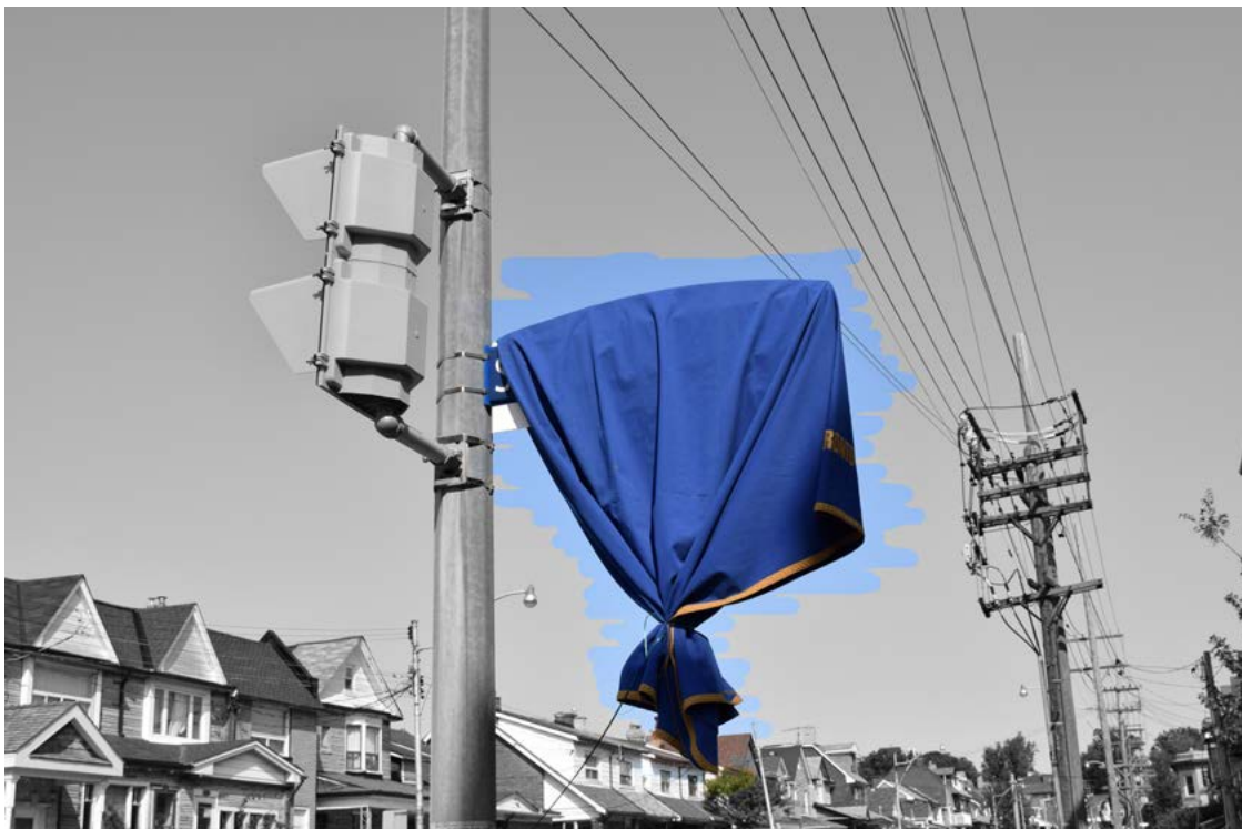
Figure 9. Toronto, unveiling event of the Salvador Allende Court, 2017.

This event for unveiling the street name brought the community together. As the Canadian and Chilean keynote speeches highlighted, the commemoration of the former president demonstrated the relevance of the recognition of a foreign community within a newly constituted urban space. Furthermore, this event openly sought to replicate the so-called actos organized during the Chilean dictatorship by its exiled communities in different countries. “The actos offered an occasion for affected members of the exiled Chilean community to assemble, to communally mourn, and to implicitly forge mutual understanding of circumstance” (Simalchik 2006, 99). The event organizers removed the blue cloth covering the street signage in an almost sacred act between speeches, poetry readings, musical presentations, laughter, and hugs (see Figures 9 and 10).