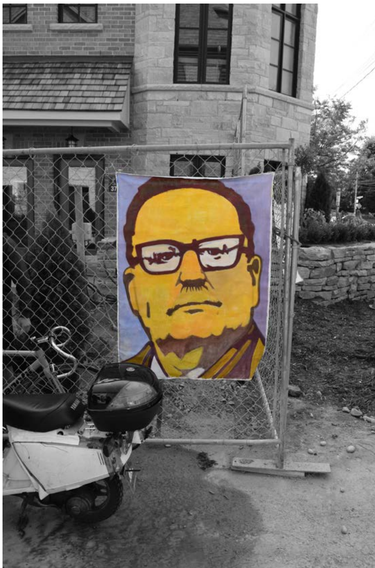
Figure 12. Toronto, unveiling event of the Salvador Allende Court, 2017.

or Montreal, urban artifacts triggered a connection to a community I did not know existed (see Figure 12). The examples presented here lead me to reflect on concepts related to odonyms and public art as significant urban artifacts, exiled immigrants as dynamic configuring agents of the symbolic urban landscape, and contemporary materialities as possible urban spaces of symbolic healing. I approached them, hoping to add a more nuanced view to commonly used sociological categories, such as immigrants. Joan Simalchik rightly noted that Chilean exiles “were not immigrants seeking a new land, nor were they refugees hoping to be permanently resettled” (Simalchik 2006, 96). What were they? What have they become?