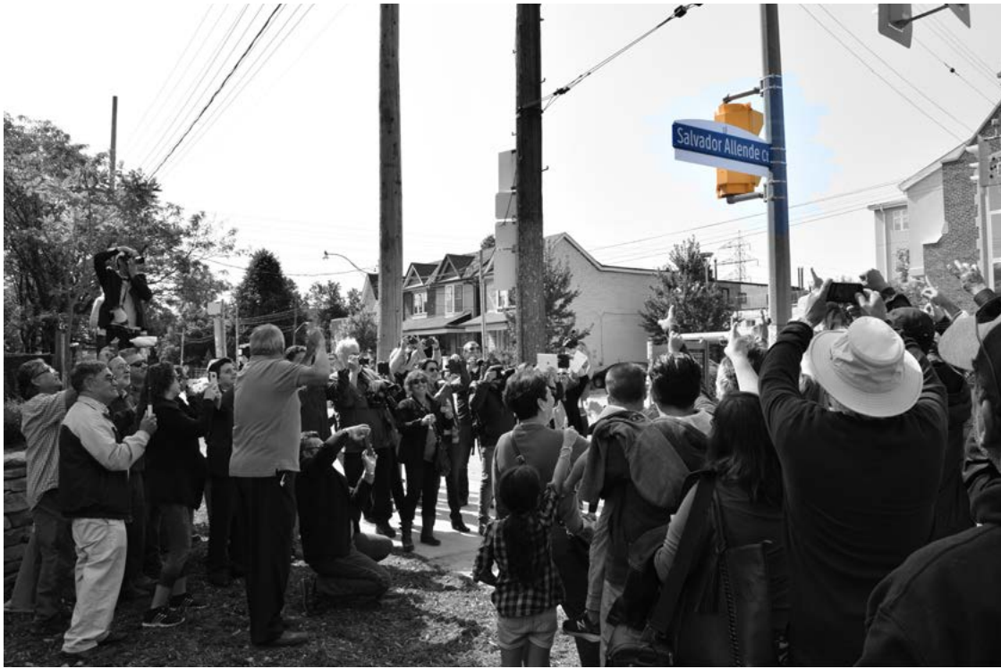
Figure 10. Toronto, unveiling event of the Salvador Allende Court, 2017.

The toponym transcends its mere materiality and intertwines with sensory attributes typical of urban life (Pink 2009), such as vehicle traffic noise, the sound of the bus stop announcement, and the movement of pedestrians at a bus stop (Moretti 2017). Moreover, Salvador Allende Court is not just a residential address, as highlighted by Mauricio in our conversations. It is also a meeting point for local Chileans and even a destination for some tourists visiting the city. Urban landscape artifacts such as toponyms thus become gateways of citizen awareness that convey specific symbols and values (Badariotti 2002). They facilitate understanding some of the reasons and circumstances of the arrival of an exiled community and its connection to the social and symbolic contexts, an understanding made possible through the intrinsic attributes of urban materiality (see Figure 11).