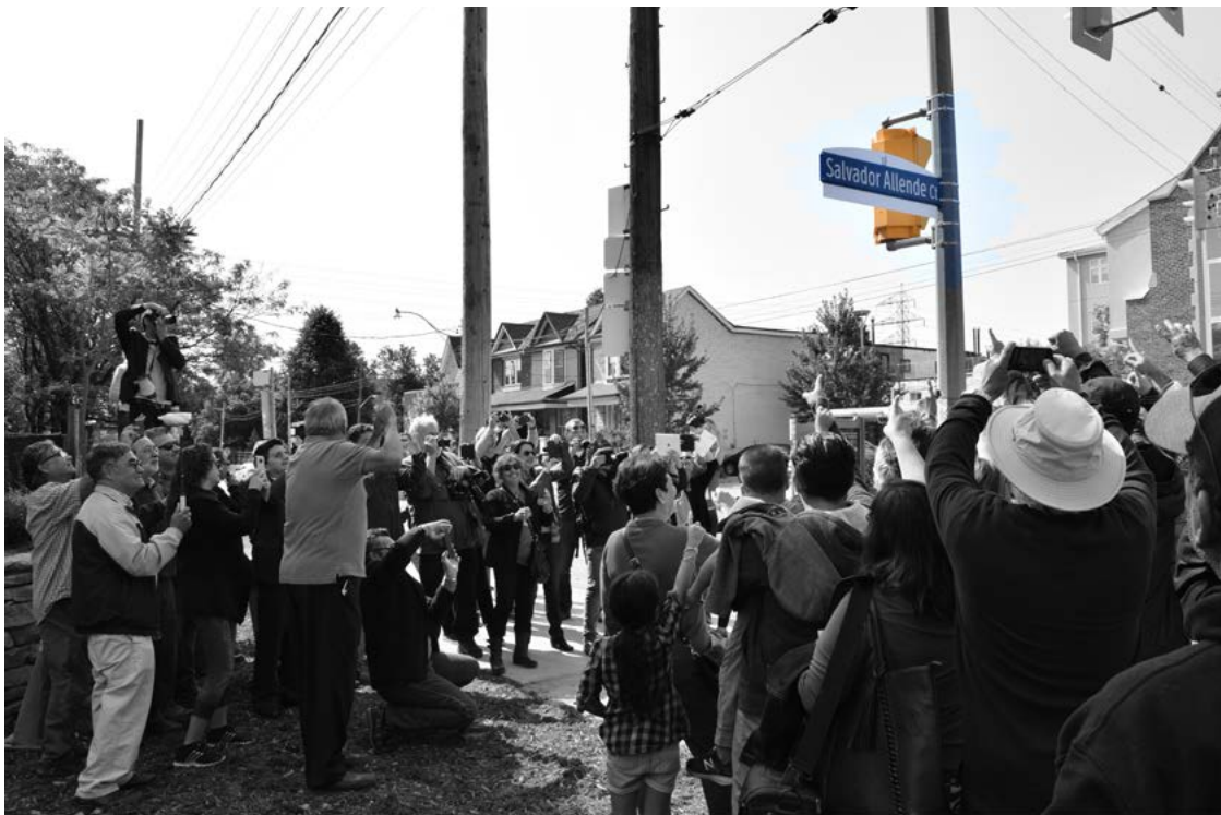
Figure 10. Toronto, unveiling event of the Salvador Allende Court, 2017.

The toponym transcends its mere materiality and intertwines with sensory attributes typical of urban life (Pink 2009), such as vehicle traffic noise, the sound of the bus stop announcement, and the movement of pedestrians at a bus stop (Moretti 2017). Moreover, Salvador Allende Court is not just a residential address, as highlighted by Mauricio in our conversations. It is also a meeting point for local Chileans and even a destination for some tourists visiting the city. Urban landscape artifacts such as toponyms thus become gateways of citizen awareness that convey specific symbols and values (Badariotti 2002). They facilitate understanding some of the reasons and circumstances of the arrival of an exiled community and its connection to the social and symbolic contexts, an understanding made possible through the intrinsic attributes of urban materiality (see Figure 11).