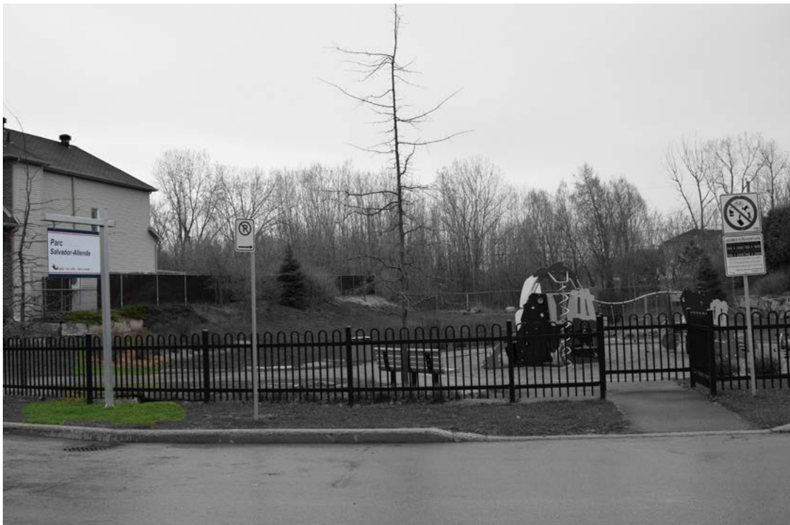
Figure 7. Laval, Salvador Allende Park, 2017.

On this anniversary of Pinochet's coup d'état , the Laval municipality gave the name Salvador Allende to a little park located on a homonymous street (see Figure 7). The city added a new material device with political significance to a physical space that has little or nothing to do with the name it bears. How many residents know its history? How many residents feel connected to it? Probably none. How many city residents will feel a connection to the name? Perhaps many 8 . What seems more evident is that one should not take for granted the existence of a single type of agency associated with these artifacts.