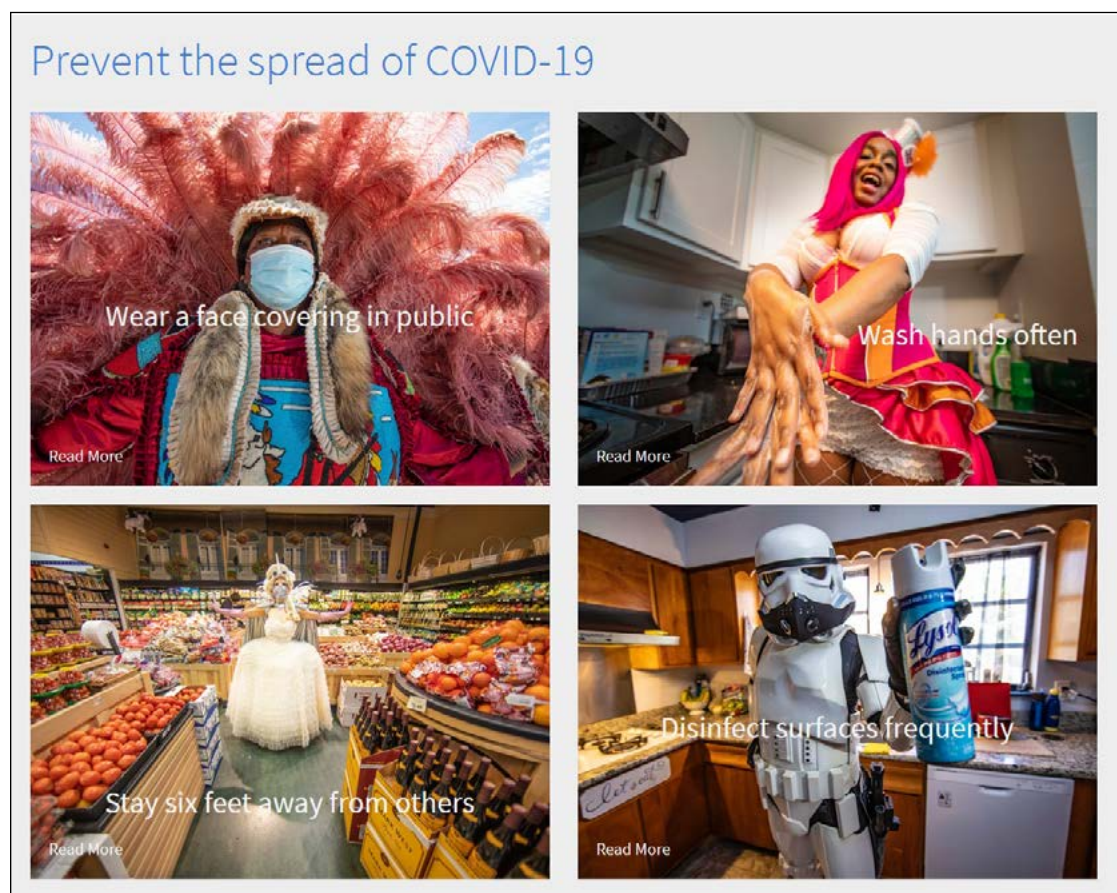
Figure 4: Carnival participants showing how to prevent the spread of COVID-19.

Until then, carnival is a rallying point for New Orleanians. The NOLA Ready website for the City's Office of Homeland Security and Emergency Preparedness currently features a set of four photographs of people taking steps to "Prevent the spread of COVID-19" (Figure 4). What is compelling about this imagery is that everyone is a figure from carnival. The upper left quadrant shows a Mardi Gras Indian, the Medicine Man of the 9th Ward Black Hatchet tribe, in his beautiful beaded suit, feathers radiating behind his face, around which he wears a disposable protective mask. His image is overlaid with the words "Wear a face covering in public." Upper right, a Black member of the Pussyfooters women's dance troupe, wearing their signature hot pink and tangerine corset, joyfully illustrates the instruction to "Wash hands often." Bottom left, a white woman from the Krewe of Merry Antoinettes wearing an 18th-century-style dress with side hoops (and a face mask) spreads her arms wide in an empty grocery store, making sure to "Stay six feet away from others." Bottom right, a Stormtrooper from Star Wars, wearing a face mask, holds a can of Lysol disinfectant, illustrating the instruction to "Disinfect surfaces frequently."