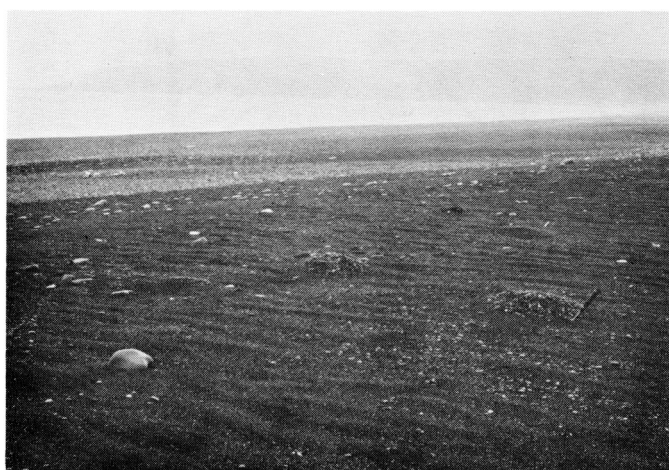
Fig. 4. The beach strand. Groups of orientated gravel cones and sand ridges form in response to strong, gusty, unidirectional winds.

winds and an abundant sand supply have resulted in a number of small-scale aeolian forms on the beach surface, as well as various stages of burial of the pebble pavement (Fig. 4).