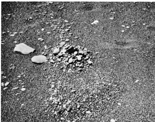
Fig. 2. Newly formed gravel cone. Note key case for scale. In the foreground a gravel cone is being buried by sand.