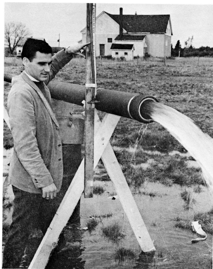
Figure 3 Recent pumping test (rate 430 imp. gallons per minute) of a sand and gravel aquifer near Truro, N.S. Aquifer is capable of producing several million gallons per day.

An investigation of the groundwater resources in the Annapolis-Cornwallis Valley has been underway since 1964. This program has been largely under the direction of P. C. Trescott of the Groundwater Section. Trescott has shown that major aquifers are present in the Triassic bedrock and in the overlying surficial deposits. In the extensive Triassic sandstones and conglomerates it is often possible to construct wells which will yield several hundred imperial gallons per minute. Locally in the eastern and central parts of the valley, wells can be constructed in the highly permeable glacio-fluvial aquifers to yield over a thousand imperial gallons per minute. The chemical quality of groundwater from the various geologic units in this area has been determined from hundreds of water samples, and the results have been compared statistically. Piezometer nests have been used to study groundwater movement in one area, and some cases of groundwater pollution were noted. The major part of this investigation has been published (Trescott, 1968); field investigations in the western part of the Annapolis Valley, centered about Digby, and in the Windsor-Walton area east of the Valley are nearly completed. The results of these studies will be published in 1969.