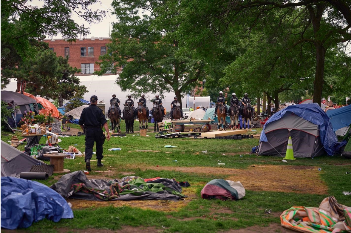
Figure 2: Encampment Eviction at Lamport Stadium, July 21, 2021. Photo Credit: Jason S. Cipparrone, shared with permission.