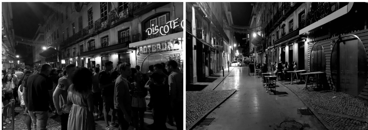
Figure 4. A comparison between nocturnal scenes before (September 2019) and during the COVID-19 pandemic (June 2020) on the world-famous Pink Street in the Cais do Sodré

As described in the previous section, tourists and Erasmus students enjoyed the pandemic Lisbon's nights drinking in the middle of the crowded streets of Bairro Alto and Cais do Sodré, while the police were punishing the youths of the working-class suburban neighborhoods of the city. In fact, the eagerness to reopen the city should come as no surprise. According to the Strategic Plan for Tourism in the Lisbon Region 2020-2014 , the nightlife is the primary reason to visit the city for a significant 18% of tourists and visitors (p. 112). Facing that, it is striking that clubs and discotheque were not allowed to re-open despite the city's opening to tourists and visitors during the pandemic summer of 2020. However, one of the reasons would have to do with the negative impacts derived from the expansion of tourism-oriented nighttime leisure economy over the past years that have undermined community livability and the coexistence between partygoers (most of them tourists and international students) and city residents (e.g., Nofre et al. 2017, 2019, 2020).