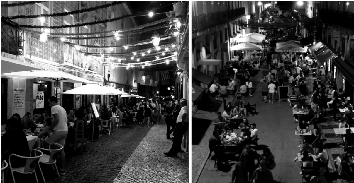
Figure 3. A Lisbon's night during the pandemic summer of 2020, in September 2020: Diaria das Notícias Street in the historical neighborhood of Bairro Alto (left), and Pink Street in the former harbor quarter of Cais do Sodré (right).

parties in domestic spaces at late night hours, and gatherings of dozens drinking in several belvederes and viewpoints of the city center such as in Miradouro de Santa Catarina, Miradouro de São Pedro Alcântara, Miradouro do Torel, Miradouro da Nossa Senhora de Graça, or Miradouro de Santo Estêvão, led Lisbon City Council to flood the city with street ads claiming "Do you know who else does not miss an illegal party? This virus" (see Figure 2 above). However, such a punitive message seemed not to affect tourists, visitors, and Erasmus students temporarily living in the city (see Figure 3 below).