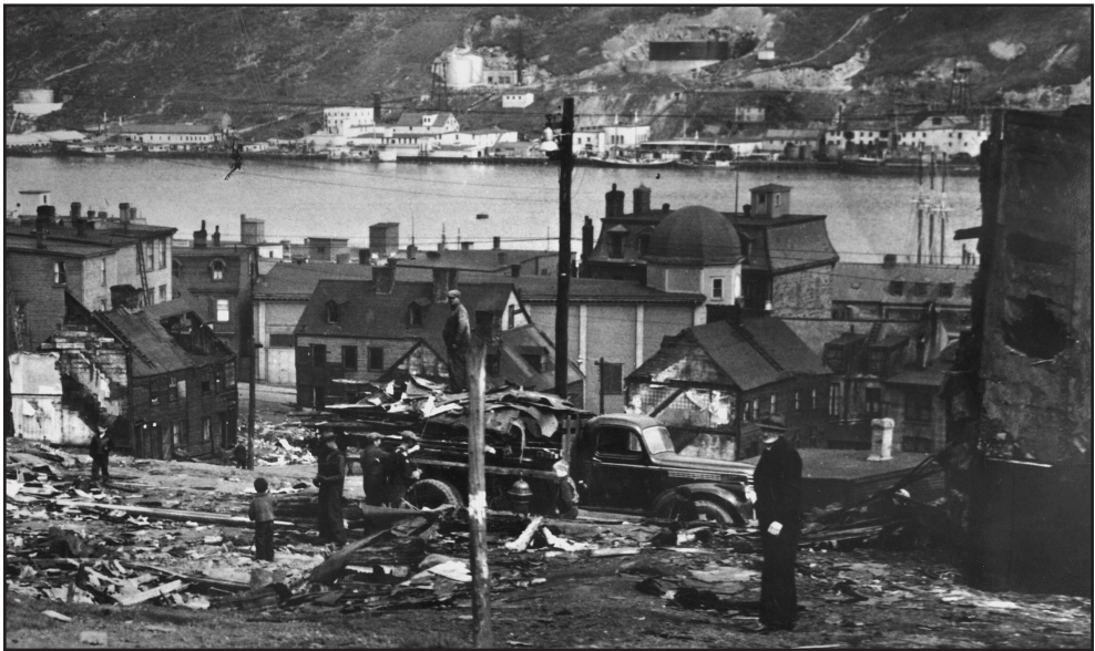
Figure 2 – Clearing the Area near Carter’s Hill