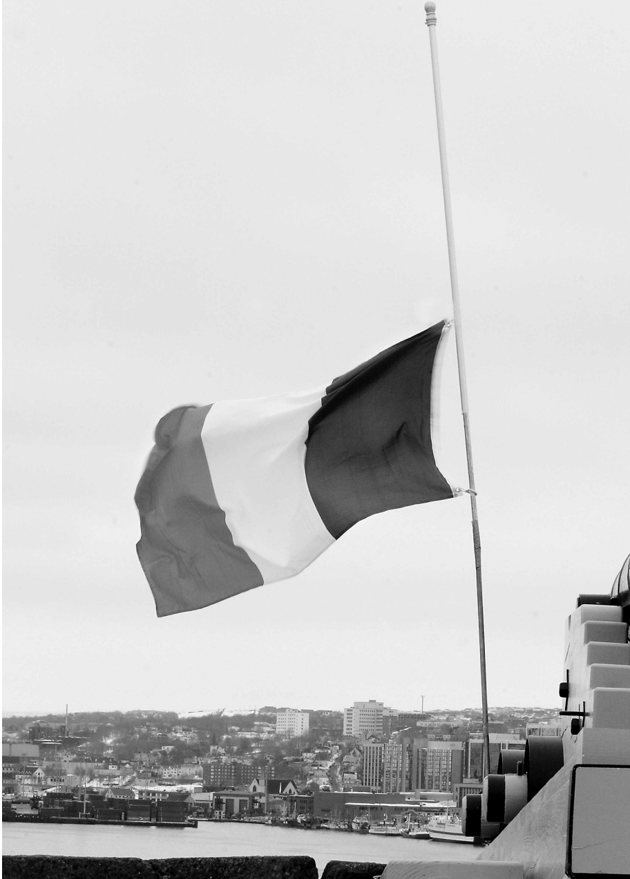
The Pink, White and Green at half-mast on Signal Hill, St. John's, April 2005.