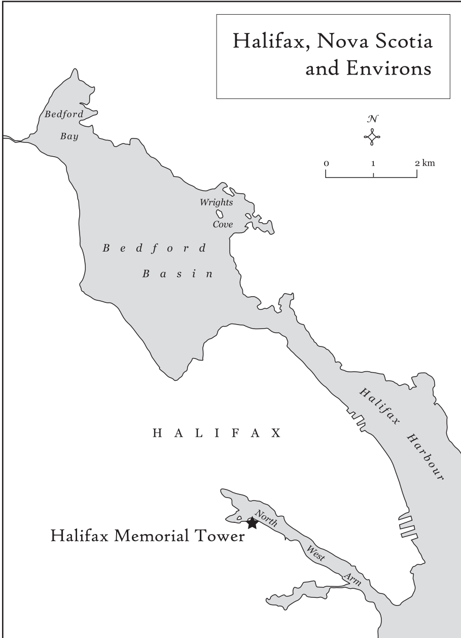
Halifax, Nova Scotia, and environs.