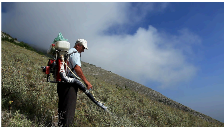
Figure 8. Armando Lulaj, NEVER , 2012. Video, Full HD, B/W and Color, Sound, 22 minutes. Courtesy of the artist, Debatik Center Film, and Paolo Maria Deanesi Gallery.