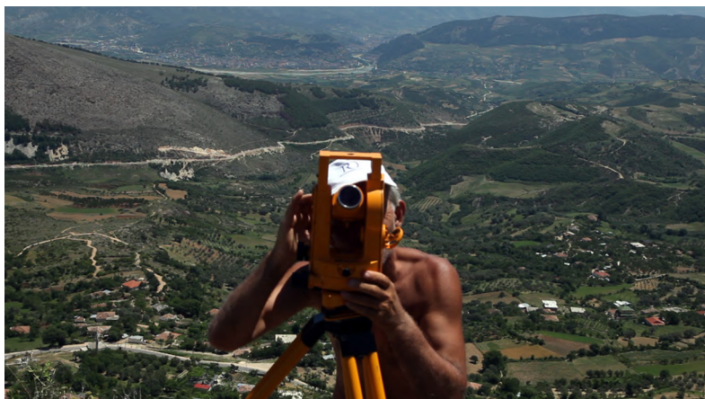
Figures 6–7. Armando Lulaj, NEVER , 2012. Video, Full HD, B/W and Color, Sound, 22 minutes. Courtesy of the artist and Debatik-Center Film.