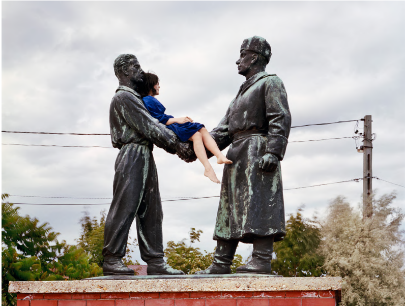
Figure 9. Liane Lang, Support Group , 2009. Digital photograph.

the fascist past with the communist one as comparable historical traumas, which have the effect of “[t]ying] all leftist political ideals to the horrors of Stalinism.” 55 By taking care, re-inscribing, and revisiting, artists like Margan, Prlja, and Lulaj show us monuments as objects that no longer exercise the domineering power they once possessed, and as such they begin to take on the same vulnerabilities as human bodies and human ideals. Of course, the particular monumental heritage these works address is very different from other bodies of monumental sculpture that are currently the focus of debate in the world—such as Confederate statues in the United States, or monuments to colonial power spread across formerly colonized geographies. Nonetheless, weak monumentality calls precisely for specificity, for understanding the particularity of interactions and experiences in relation to monuments, and for respecting the emotional claims that certain objects of heritage make upon us.