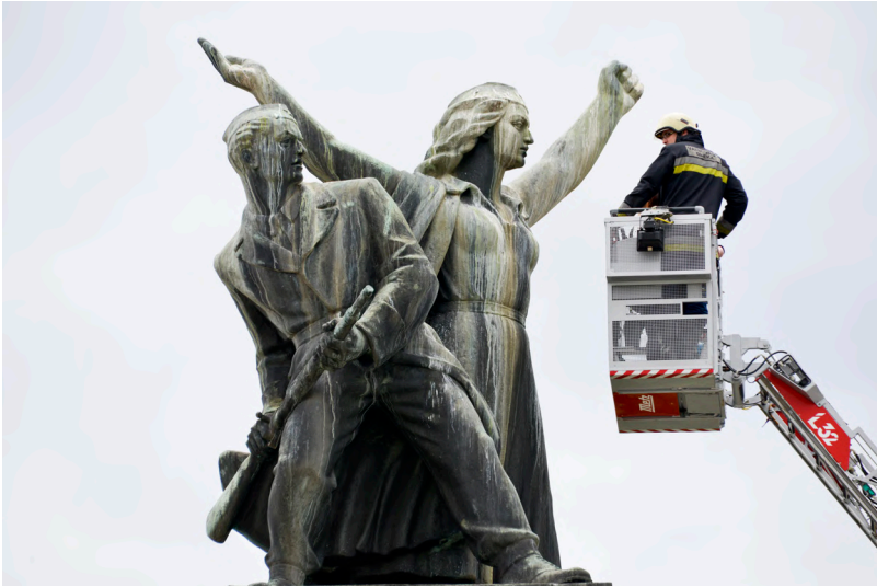
Figures 1–2. Luiza Margan, Eye to Eye with Freedom , 2014. Public intervention, Rijeka, Croatia.