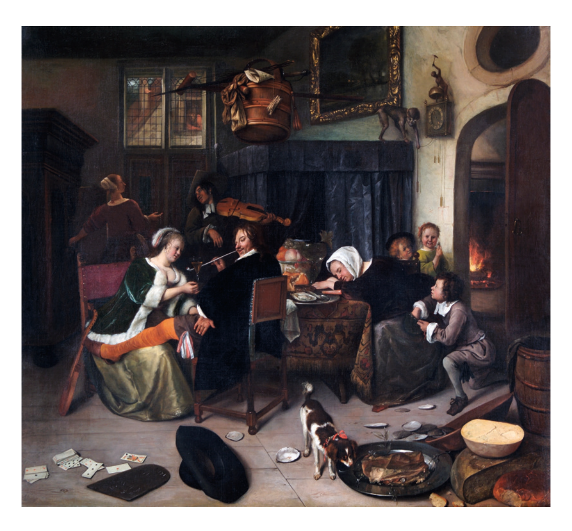
Figure 10. Jan Steen, The Dissolute Household , ca. 1661–64. Oil on canvas, 80.5 × 89 cm. London, Wellington Museum, Apsley House.