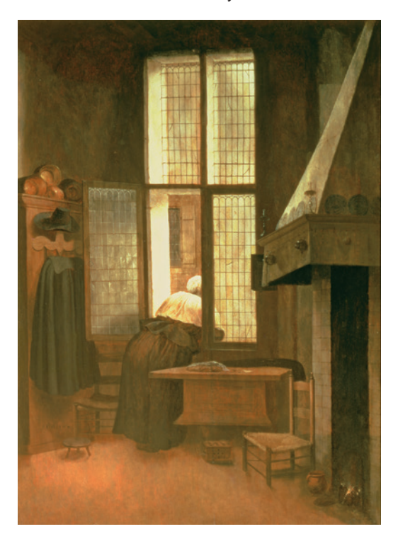
Figure 7. Jacobus Vrel, Woman at a Window, 1654. Oil on panel, 66 × 47.5 cm. Vienna, Kunsthistorisches Museum, Gemäldegalerie.

In Jacobus Vrel's characteristically humble scene, Woman at the Window (1654), the middle-class figure—framed by the multi-paned windows and illuminated by sunshine—maintains the composition's focus. | fig. 7 | Seen from the back as she peers out the window, the full curves of her garb define her ample presence. She leans out the open window and surveys the street. Extended just beyond the window frame, the back of the woman's head and her forearms