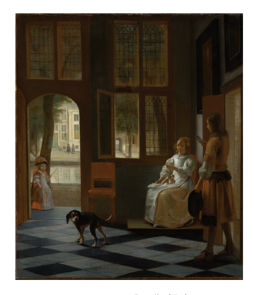
Figure. 1 Pieter de Hooch, Man Handing a Letter to a Woman in the Entrance Hall of a House, 1670. Oil on canvas, 68 × 59 cm. Amsterdam, Rijksmuseum. On loan from the City of Amsterdam (A. van der Hoop Bequest).