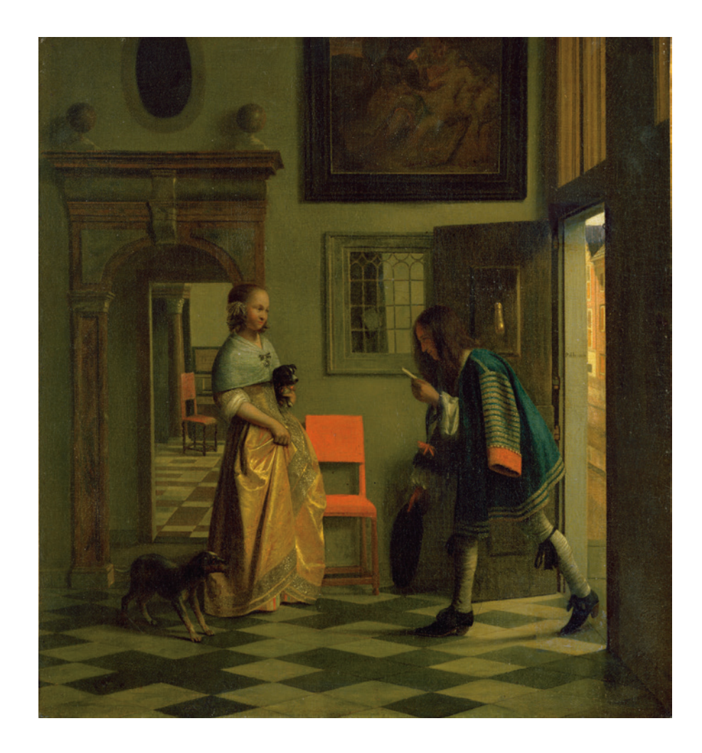
Figure 5. Pieter de Hooch, The Messenger, ca. 1668–70. Oil on canvas on panel, 57 × 53 cm. Hamburg, Hamburger Kunsthalle.