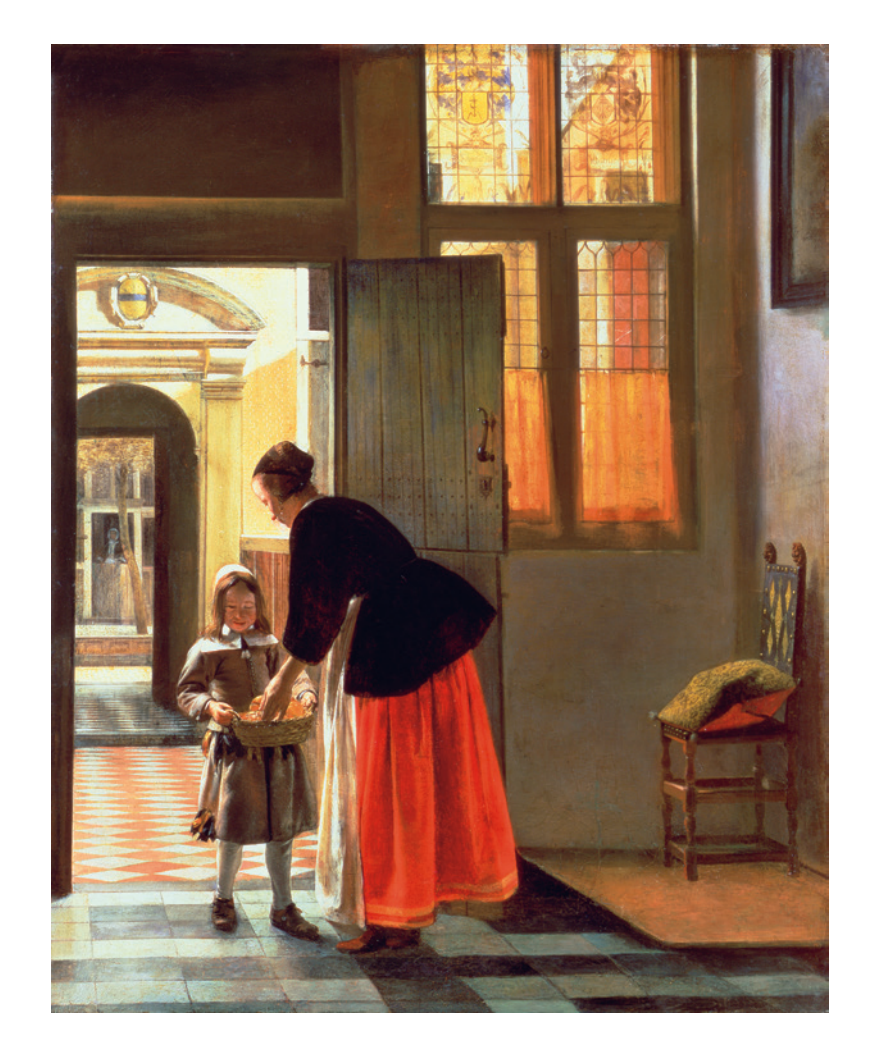
Figure 3. Pieter de Hooch, A Boy Bringing Bread, ca. 1663. Oil on canvas, 73.5 × 59 cm. London, The Wallace Collection.