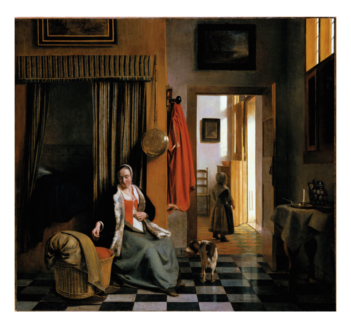
Figure 4. Pieter de Hooch, The Mother, ca. 1661–63. Oil on canvas, 92×100 cm. Berlin, Staatliche Museen Berlin, Gemäldegalerie.