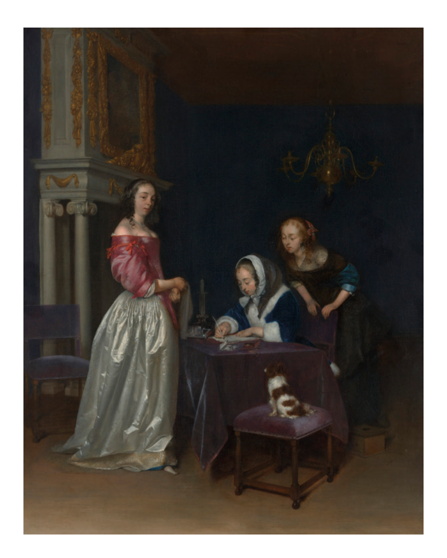
Figure 2. Gerard ter Borch, Curiosity, ca. 1660–62. Oil on canvas, 76 × 62 cm. New York, Metropolitan Museum of Art.