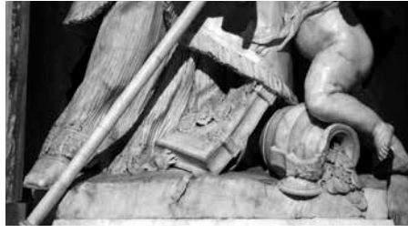
Figure 13. Pierre Puget, St. Alessandro Sauli , detail of base, 1664–67. Marble, over life-sized. Genoa, S. Maria Assunta in Carignano.