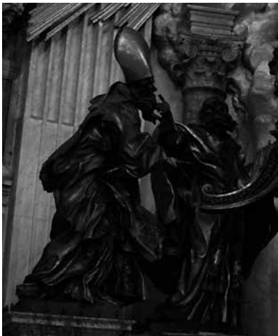
Figure 10. Gianlorenzo Bernini, St. Ambrose and St. Athanasius , detail of the Cathedra Petri , 1656–66. Gilt bronze, over-life-sized. Vatican City, St. Peter's Basilica.