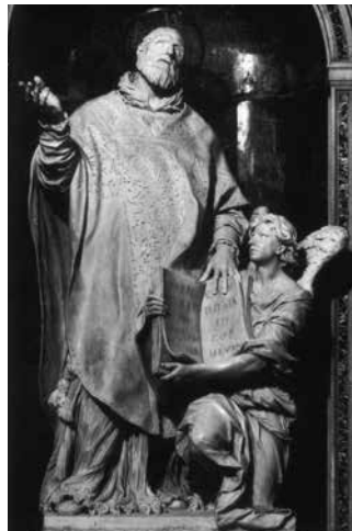
Figure 11. Alessandro Algardi, St. Philip Neri, 1636–38. Marble, c. 300 cm. Rome, S. Maria in Vallicella.