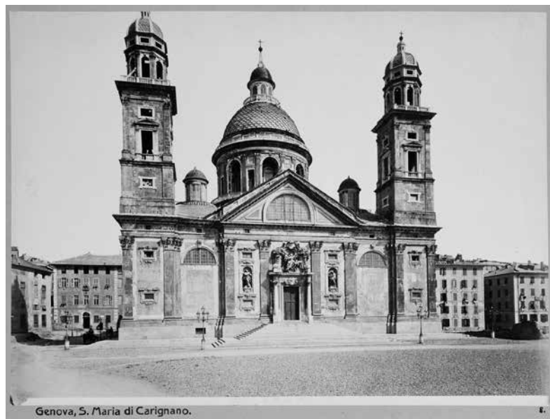
Figure 1. S. Maria Assunta, Genoa. The exterior as it appeared in 1880-1881.

Evidence of Alessandro's cult appears immediately following his death, though centred in Pavia rather than Genoa. 10 The Barnabites produced the first of their several vite in 1600, which is typical of orders promoting their own candidates. 11 The formal processus , or investigation, was launched by the Congregation of Rites in 1623, but ended inconclusively, and a fifty-year