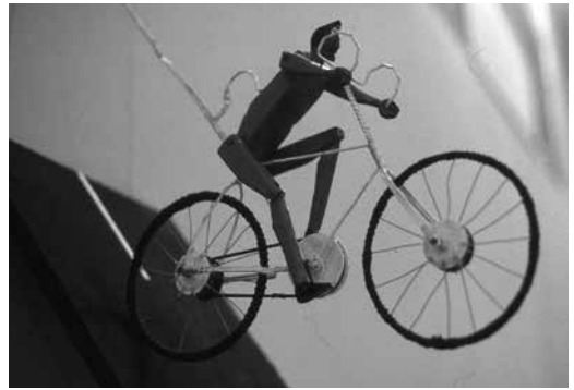
Figures 3–4. Bolívar en tallas de madera (Bolivar in Wood Carvings) , Núcleo 2, installation view, Museo de Artes Decorativas, Havana, Cuba, 1989.