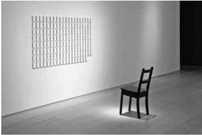
Figure 2. Adrian Stimson, Memory , 2011. Acrylic on wood, lettering on wood, chair. Grid of 158 pieces, 10.2 X 8.3 cm each.

Memory , 2011, performs this historical amnesia (fig. 2). Even if its minimalism seems to be in opposition to 10,000 plus , it remains its conceptual companion. Memory consists of a grid of one hundred fifty-eight small rectangular wood tablets with a gap at the end of the last row that implies expansion. The multiples are painted in a white acrylic wash overlaid with lettering, each designating a soldier's rank, name, and age at death (most were killed in their twenties and thirties). The modesty of the display reflects, in a way, the urgency of fast action in the theatre of war. A straight-back black chair stands in front of this minimalist grid. This familiar type of chair recalls school or any place for discipline and punishment. Stimson's Memory collapses the singular into the systemic; it entwines the trauma of residential school with the trauma of military regulation.