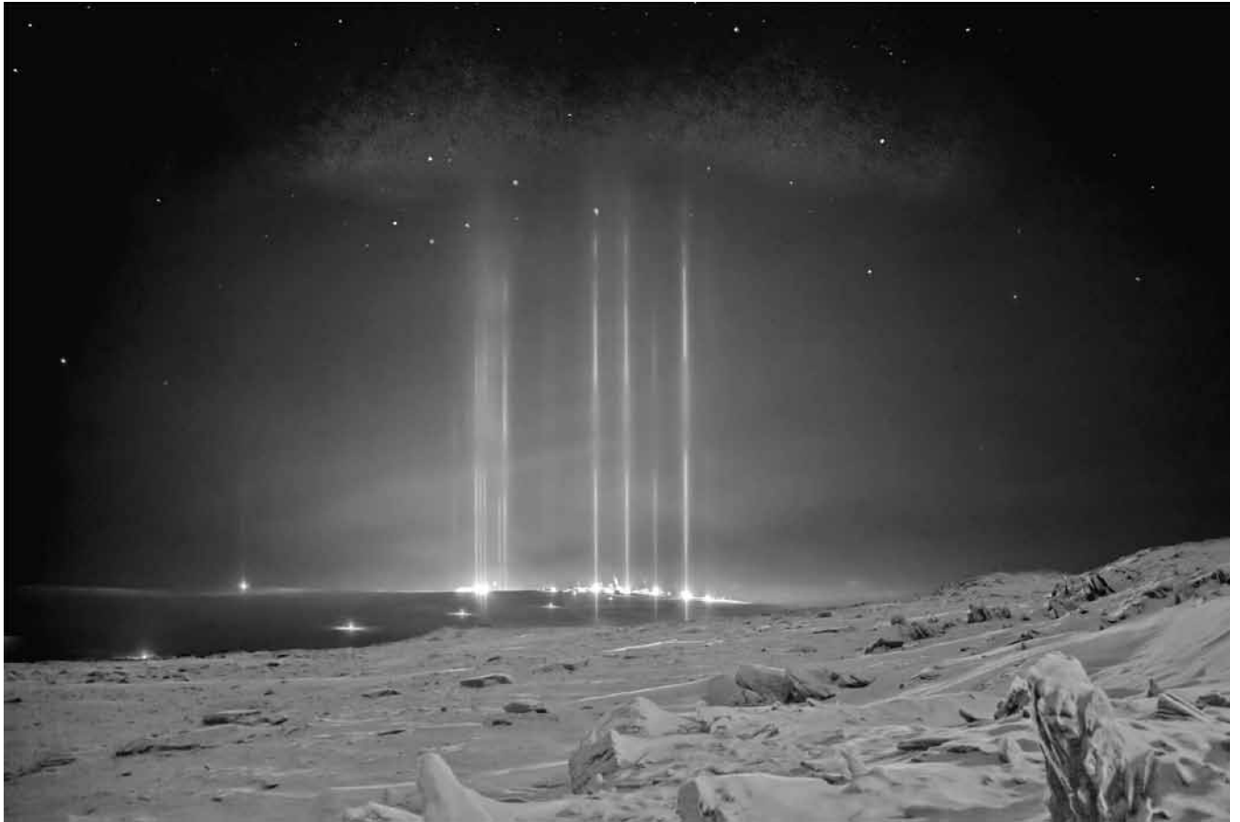
Charles Stankieveh, The Soniferous Æther of The Land Beyond The Land Beyond , 2013. 35mm Film Installation with Dolby Sound (Film Still).