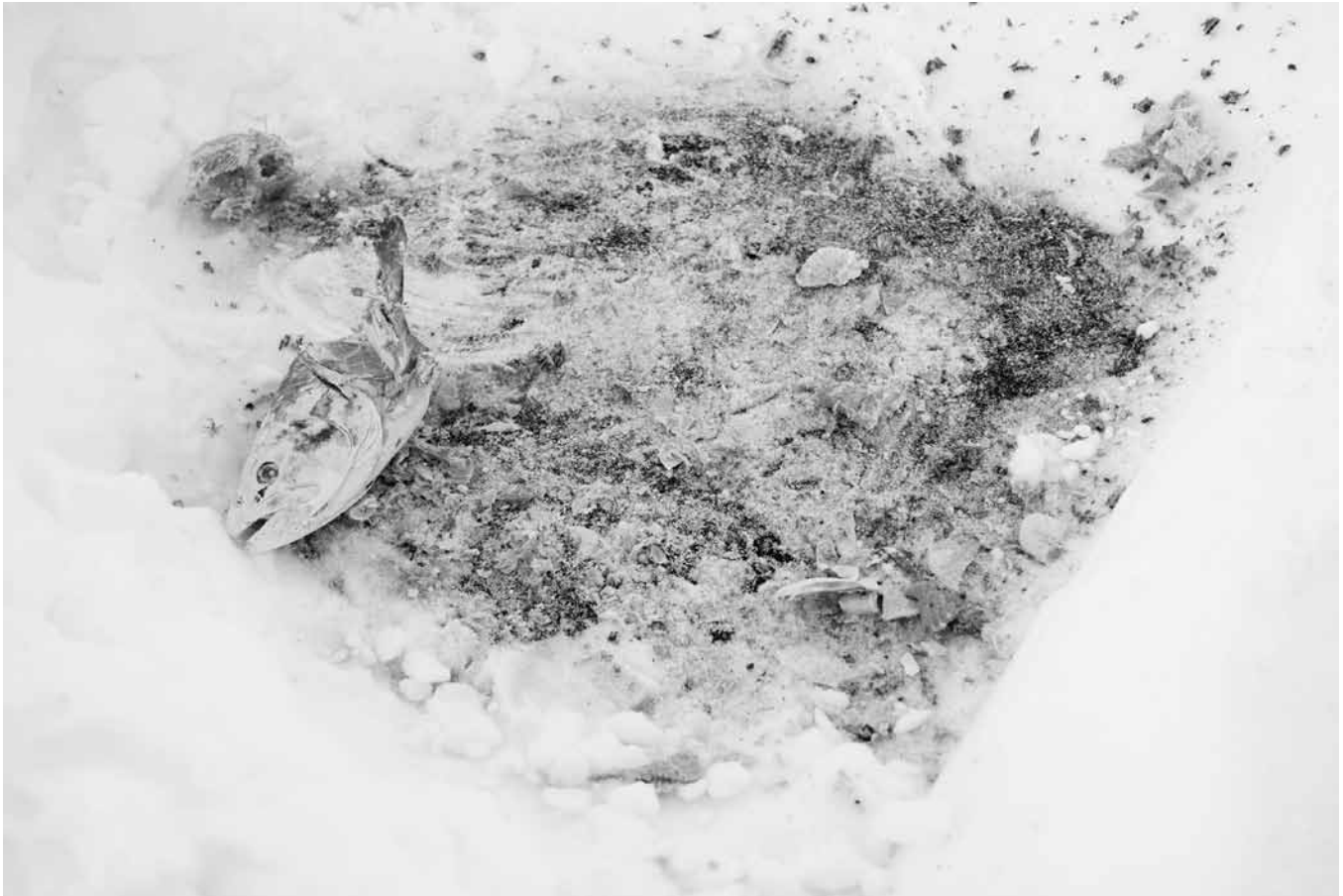
Erin Riley, Operation Nunaliivut, Ellesmere Island , 2009. Colour photograph.