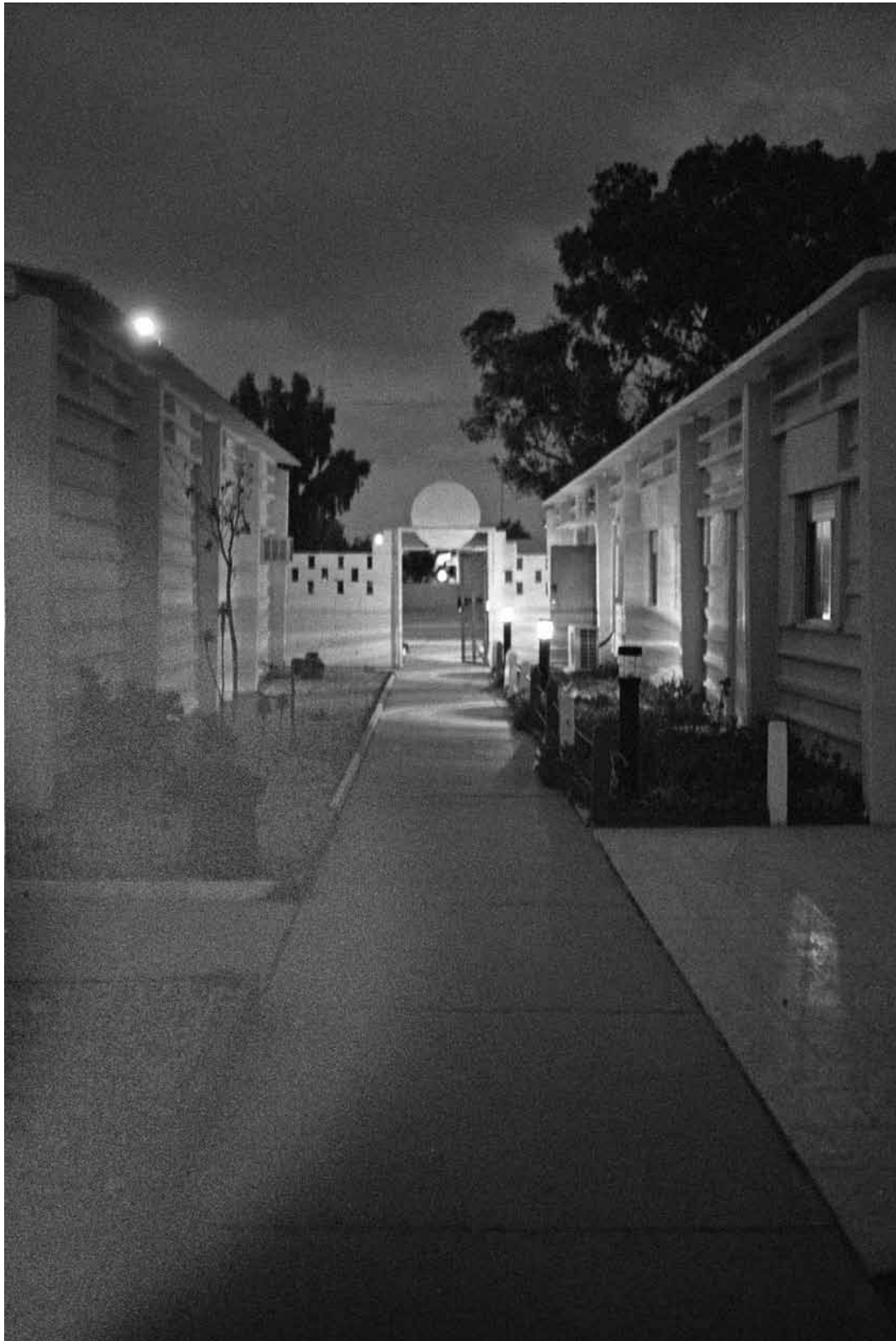
Allen Ball, CANCON , 2012. Polymer resin and digital print on canvas, 72 x 48 in.