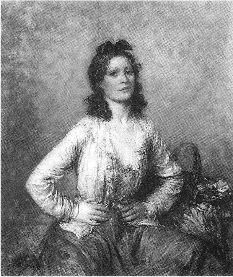
Figure 5. Walter Russell, The Flower Girl , undated. Oil on canvas, 61 x 50.8 cm. Glasgow Art Gallery and Museum.

cheeky, defiant, untameable, godless, a mighty woman of her hands. The others, bless them, are all so very much "just so." They will one day bring their males up to their own high level; but meanwhile perfection palls. It is odiously ungrateful, but there seems no "bite" in their pretty ways, their soft voices, their allusive turns of phrase .... these hothouse flowers abound at every step, and after excessive orchid one would fain see the wild rose. 35