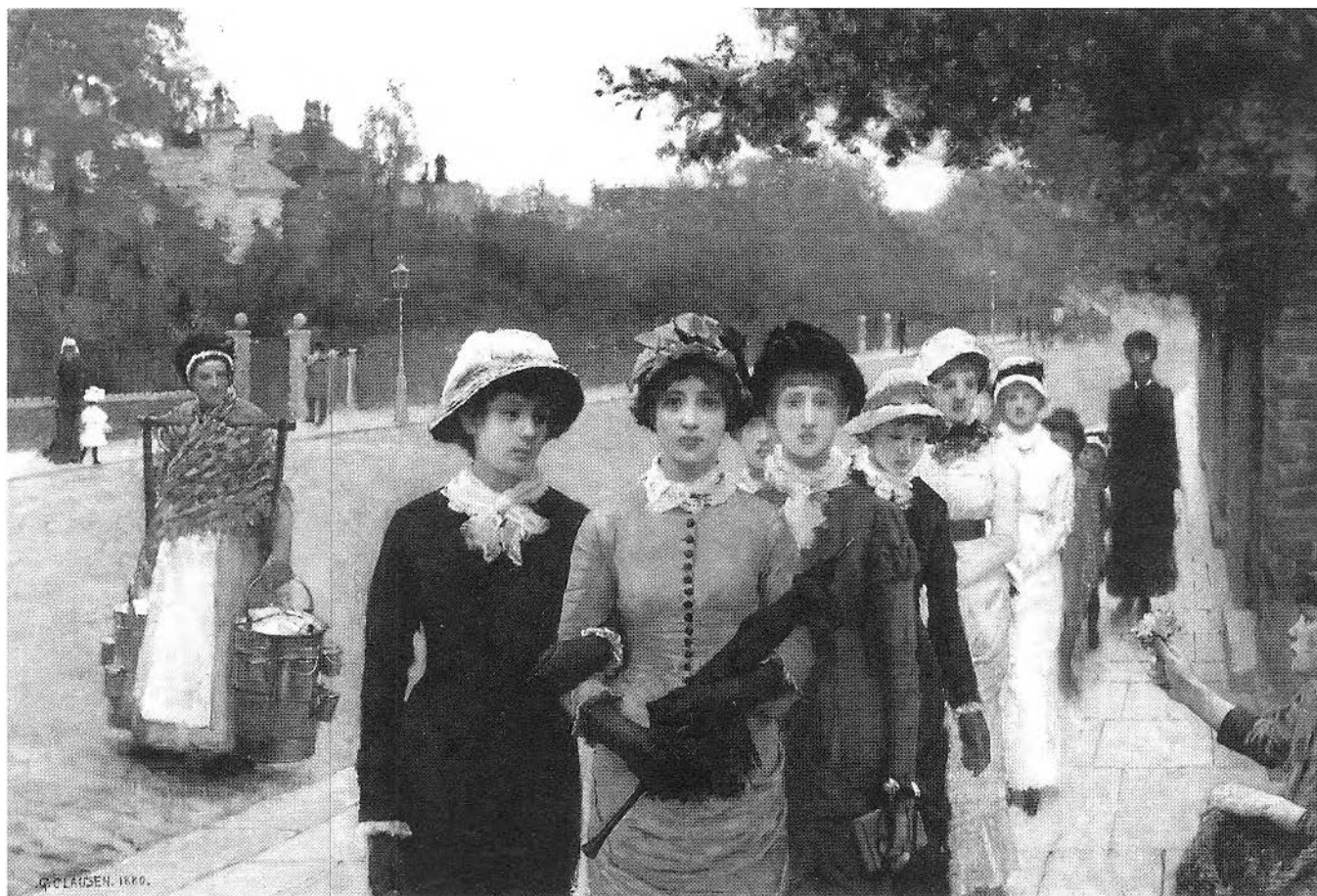
Figure 4. George Clausen, Schoolgirls, Haverstock Hill, 1880 . Oil on canvas, 51 x 76 cm. Private Collection.

not only deserving of a helping hand, she was part of the ground upon which a liberal middle-class could rebuild society in its own image.