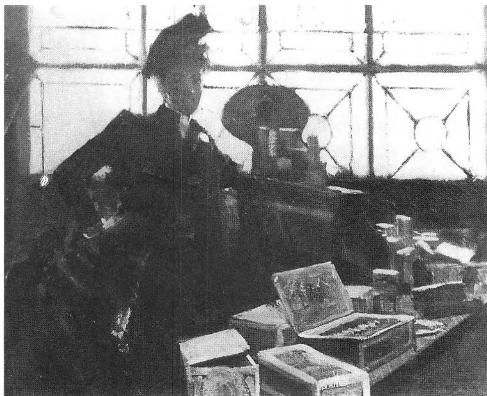
Figure 7. John Lavery, The Cigar Seller at the Glasgow Exhibition, 1888 . Oil on canvas, 30.5 x 38.2 cm. Private Collection (Photo: The Fine Art Society, London).

The relation of flower-sellers to this process is complex and sometimes contradictory. In an expanding service economy, the flower-seller was one of a growing number of women whose work was tied to the sale of commodities, and whose public representations were commonly cast in terms of available sexuality. Barmaids, milliners and shop assistants were linked to the flower-seller through a predominant conjunction of economic, erotic and epistemic models which associated selling with sex. 46 Assuming the personalized perspective of the customer, John Lavery's 1888 canvas The Cigar Seller at the Glasgow Exhibition (fig. 7) offers a glimpse into a world of commerce where the incursion