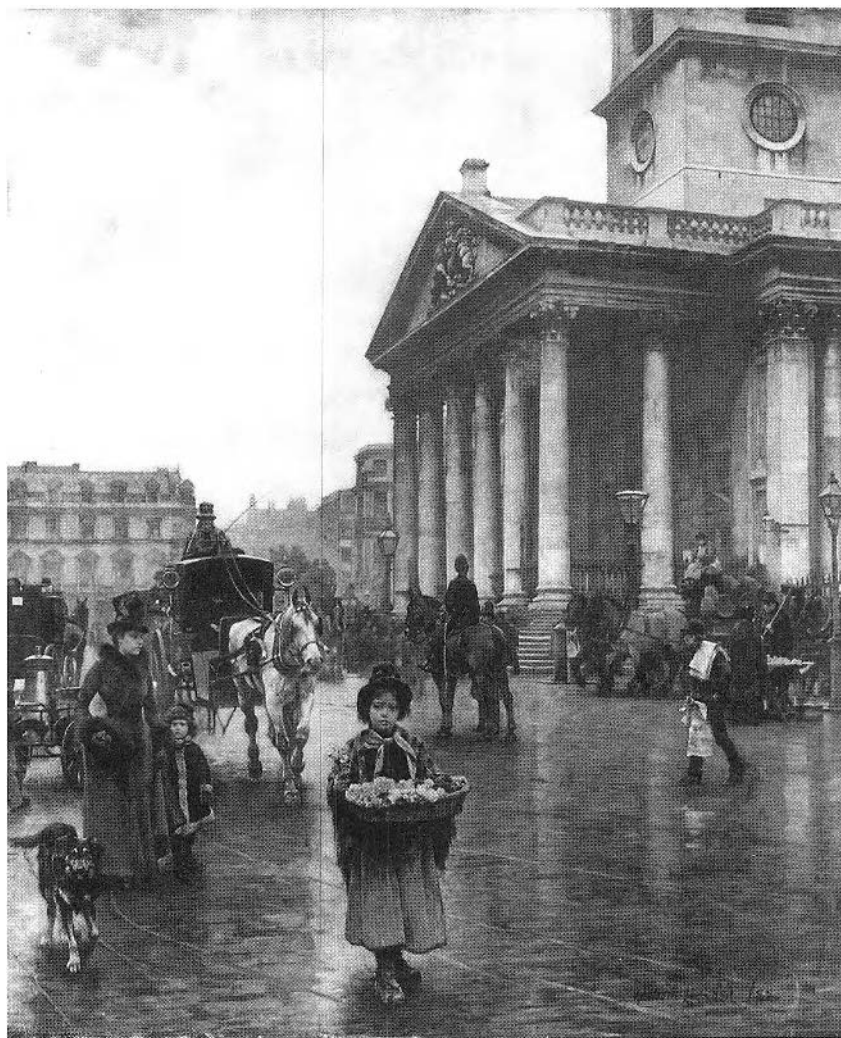
Figure 2. William Logsdail, St Martin's-in-the-Fields , 1888. Oil on canvas, 143.5 x 118.1 cm. London, Tate Gallery.

Seller, Trafalgar Square (1879, fig. 1) and William Logsdail's St Martin's-in-the-Fields (1888, fig. 2). A.E. Mulready, that most prolific painter of flower-girls, dotted his favourite subjects liberally across the urban scene: in opulent shopping districts and busy professional quarters, by brightly illuminated public houses, near residential areas, and especially on London bridges (fig. 3). 11 Affluent residential locales were also adopted by W.P. Frith, in The Flower Girl (1883, private collection), and by George Clausen, in Schoolgirls, Haverstock Hill (1880, fig. 4) and Spring Morning, Haverstock Hill (1881, Bury Art Gallery).