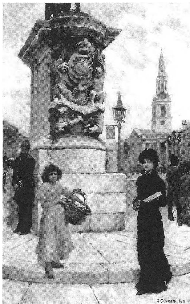
Figure 1. George Clausen, Flower-Seller, Trafalgar Square , 1879. Oil on canvas, 60 x 38 cm. Private Collection.

across the city. Prominent thoroughfares, such as Ludgate Hill, Oxford Circus and St Giles’ Circus are identified as important areas for business, as are Fleet Street and the Strand. Shopping districts such as Westbourne Grove in Bayswater were said to be good for the sale of loose flowers, while buttonholes sold best in the City or by smaller railway stations. Predictably, Covent Garden market when the morning stock was being purchased was the best place to find a flower-seller. Vendors were not confined to these locales, however. Ryan reports that it was also common practice to tour residential areas, calling at likely houses. Furthermore, an itinerant night trade was conducted in public houses throughout the city.