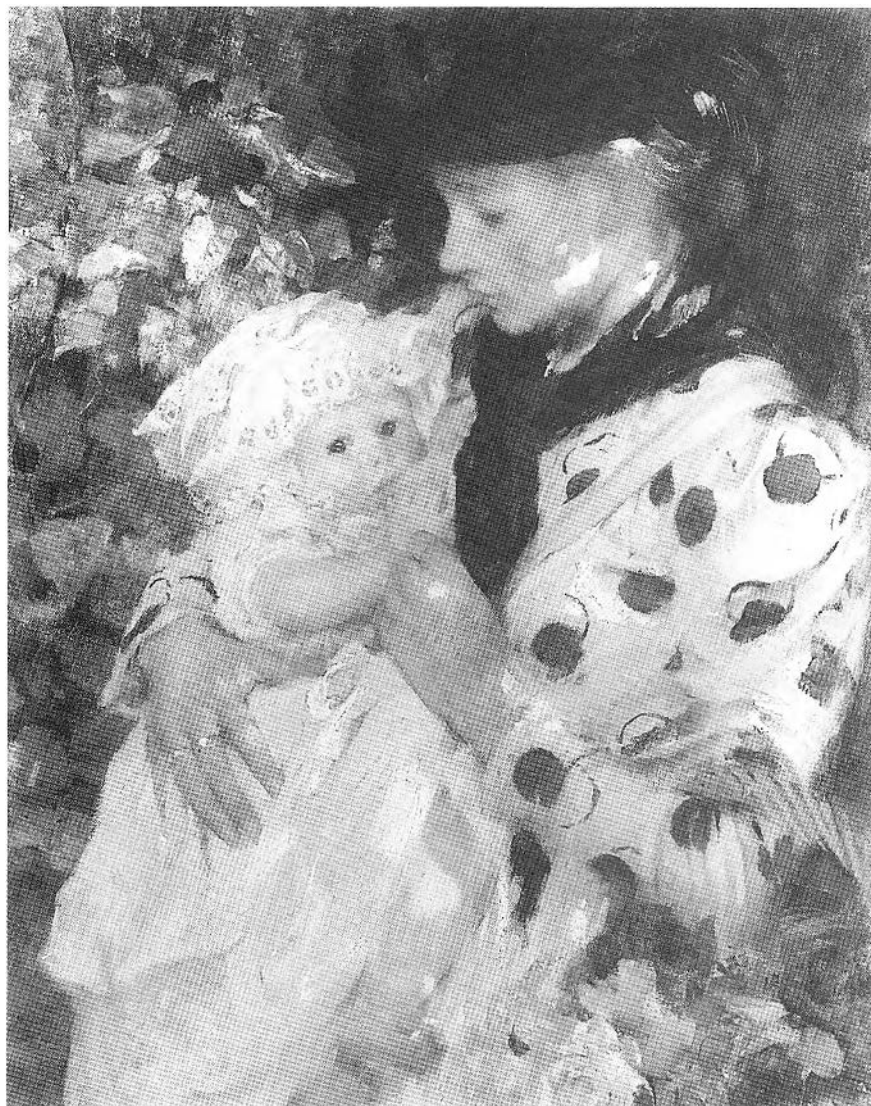
Figure 11. James Shannon, The Flower Girl , 1900. Oil on canvas, 84 x 67.5 cm. London, Tate Gallery.

ers in great cities railways have multiplied flowers fifty-fold, because the swiftness of our present means of communication has so immensely extended the area of production.” 76