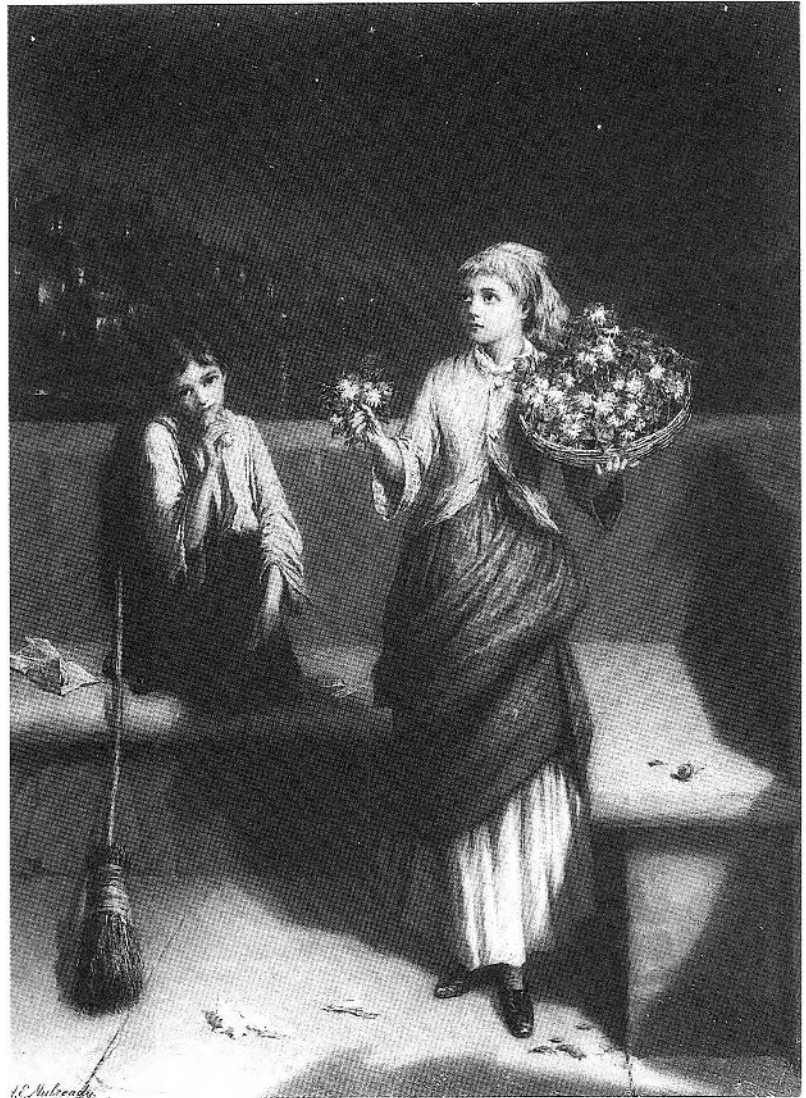
Figure 3. A.E. Mulready, A London Crossing Sweeper and Flower Girl , 1884. Oil on canvas, 97.8 x 50 cm. Museum of London.

those Red Women who glide from floor to floor to distribute leaflets of convocation to fiery meetings against Throne and Altar ... one of [whom] is just now struggling for the possession of the virgin soil of Tilda's nature in competition with the Watercress and Flower Girls' Mission. 23