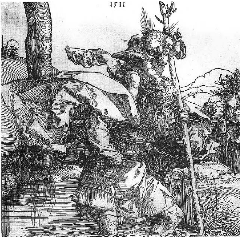
Figure 2. Albrecht Dürer, St Christopher , 1511. Woodcut, 21 x 21 cm. The British Museum.

linked to the ideal atemporal character of devotional imagery—the definition is Jameson’s— 7 through a dialectic between the narrative historical aspect of Christopher’s action and an implicit allegory of charity presented for contemplation. The contemplative provision merges with magical belief in apotropaic powers attributed to the sight of St Christopher’s image.