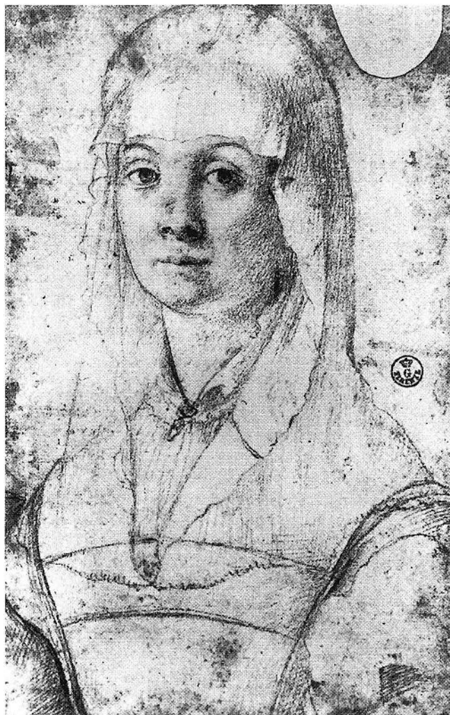
Figure 4. Agnolo Bronzino, Maria Salviati as a Young Widow, ca. 1527-30. Drawing, black chalk, 20.2 x 12.3 cm. Florence, Uffizi Gabinetto Dis. e St. no. 6680F.

the earliest date that can be proposed for the Baltimore portrait—exposing him for two years to powerful European interests. He was received officially by the Doge, the Papal Legate and the Venetian Council, and was presented to the ambassadors of France and England. 34 Cosimo's exile with her in Bologna shortly after allowed him to witness Clement's historical coronation of Charles V in 1529. 35 When the frugal Maria hesitated to attend the marriage of Caterina de' Medici in Marseilles in 1533, her father, Jacopo Salviati, urged her not to forgo this opportunity to keep Cosimo at the forefront of European interests. 36