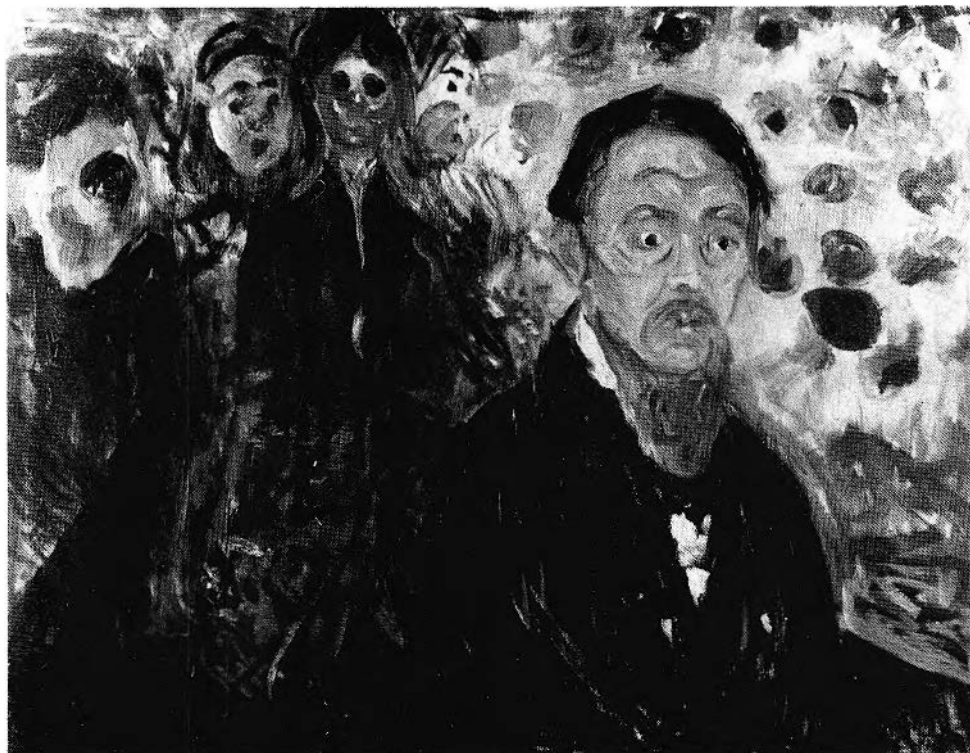
FIGURE 24. E. Munch, The Surprise , 1907. Oil on canvas, 85 × 110 cm. Oslo, Munch-Museet (Photo: Edvard Munch , Vancouver, 1986).