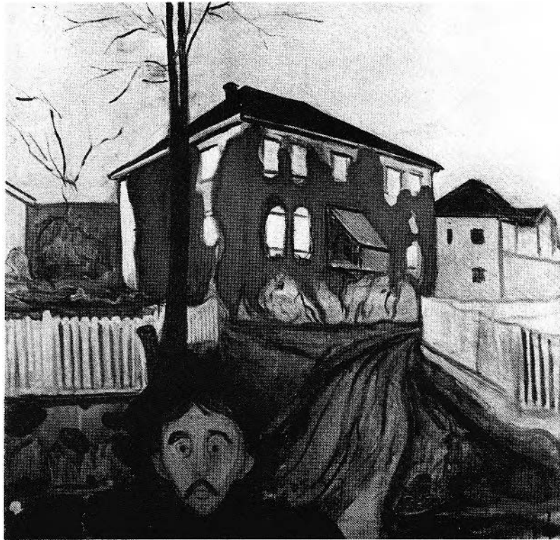
FIGURE 22. E. Munch, The Red Vine , 1898. Oil on canvas, 119 × 121 cm. Oslo, Munch-Museet (Photo: Edvard Munch: The Man and His Art , New York, 1977).