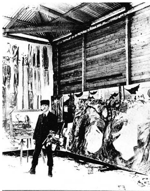
FIGURE 25. Edvard Munch in his outdoor studio at Ekely. (From Edvard Munch: The Man and His Art , New York, 1977).