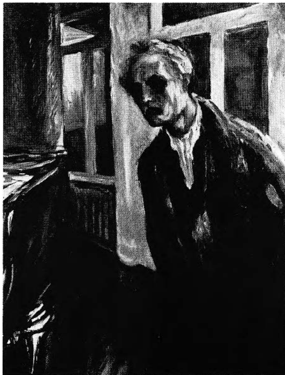
FIGURE 27. E. Munch, Self-Portrait, The Night Wanderer , 1923-24. Oil on canvas, 89.5 × 67.5 cm. Oslo, Munch-Museet (Photo: Edvard Munch , Vancouver, 1986).