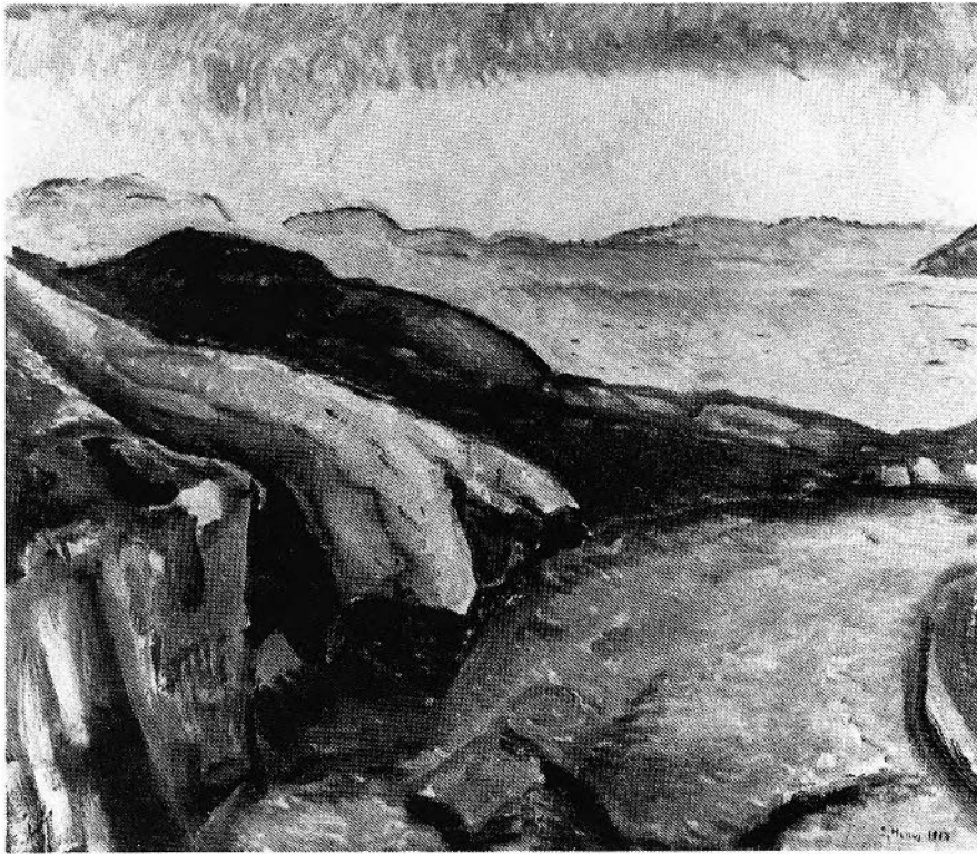
FIGURE 26. E. Munch, Rainy Weather on the Coast, Kragero , 1913. Oil on canvas, 93 × 107 cm. Oslo, Munch-Museet (Photo: Edvard Munch , Vancouver, 1986).