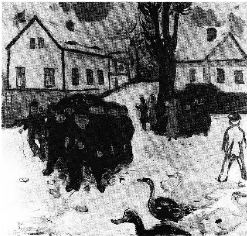
FIGURE 23. E. Munch, Young People and Ducks , 1905-08. Oil on canvas, 100 × 105 cm. Oslo, Munch-Museet (Photo: Edvard Munch , Vancouver, 1986).