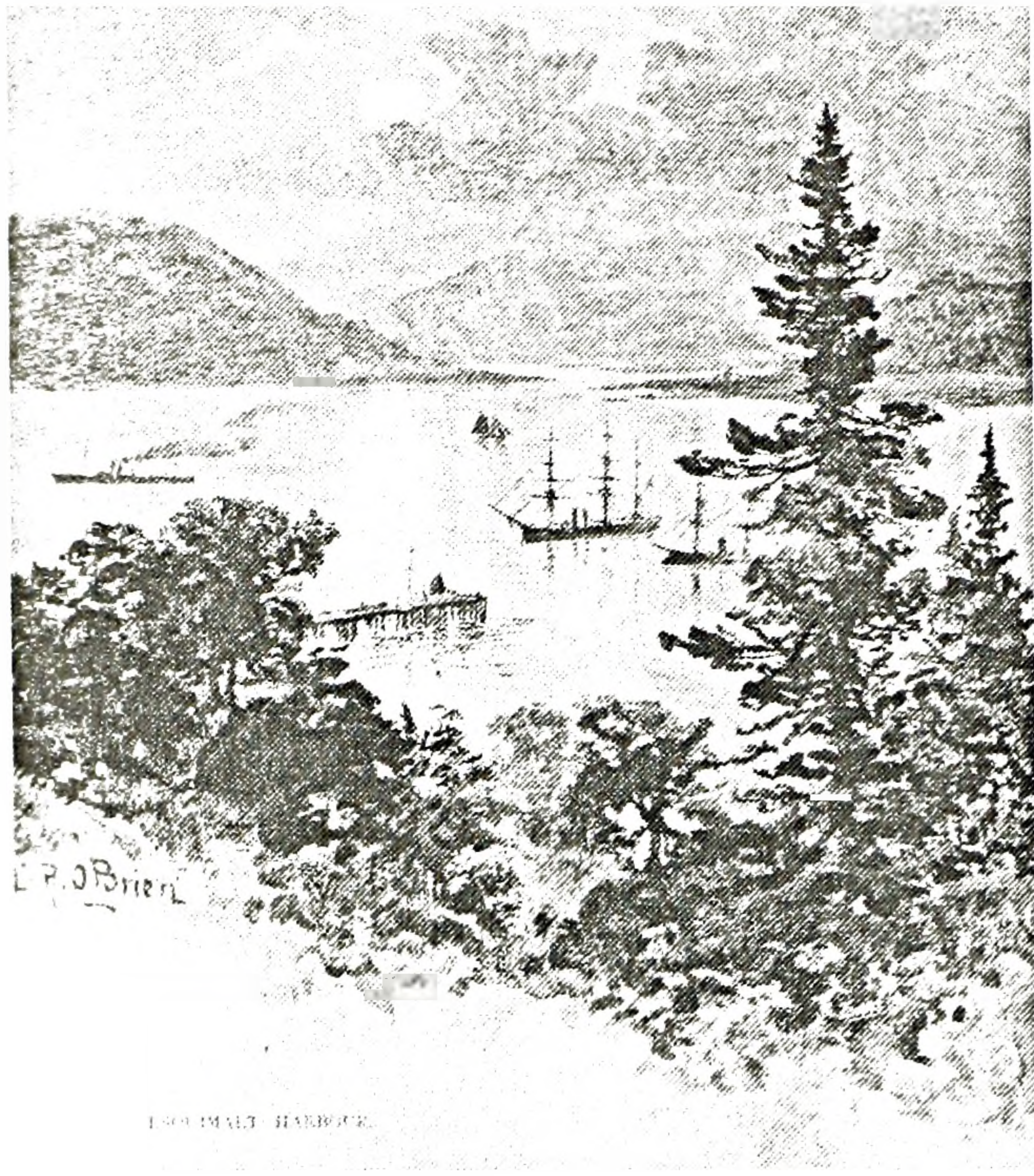
FIGURE 4. Lucius O'Brien, Esquimalt Harbour . From Picturesque Canada , 11, 871.

Paradisal Imagery in Southern Ontario . These decorative towels were embroidered before their marriage by Ontario Mennonite girls, and adopted certain motifs seen in early German and Swiss embroidery and painting.