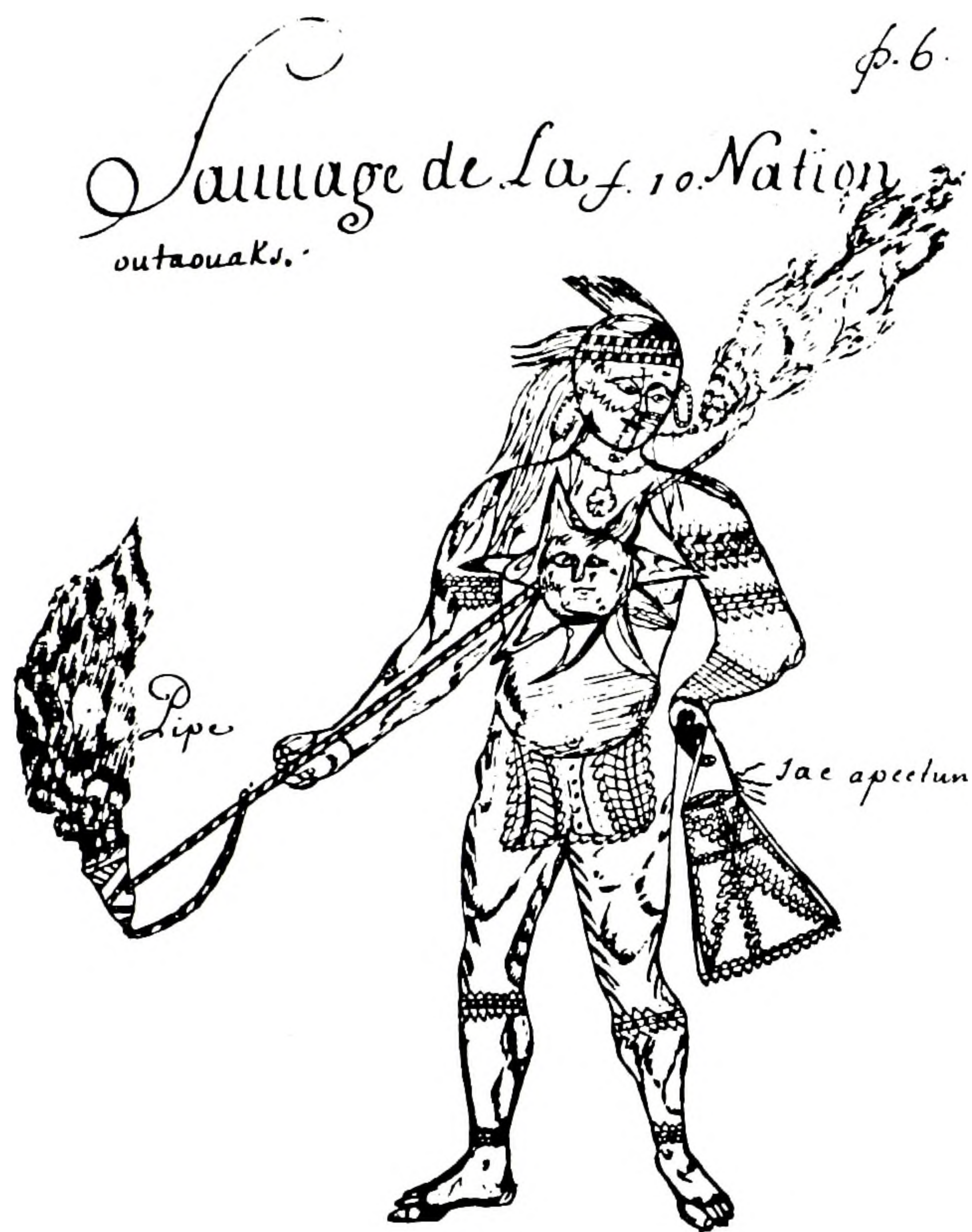
FIGURE 5. Sauvage de la nation outaouais . From Codex Canadensis .

within the past ten years. A distinction was made between 'photographers' and 'artist-photographers.' He observed that the form and the presence of earth-works structures are communicated principally through photographic images (Fig. 6).