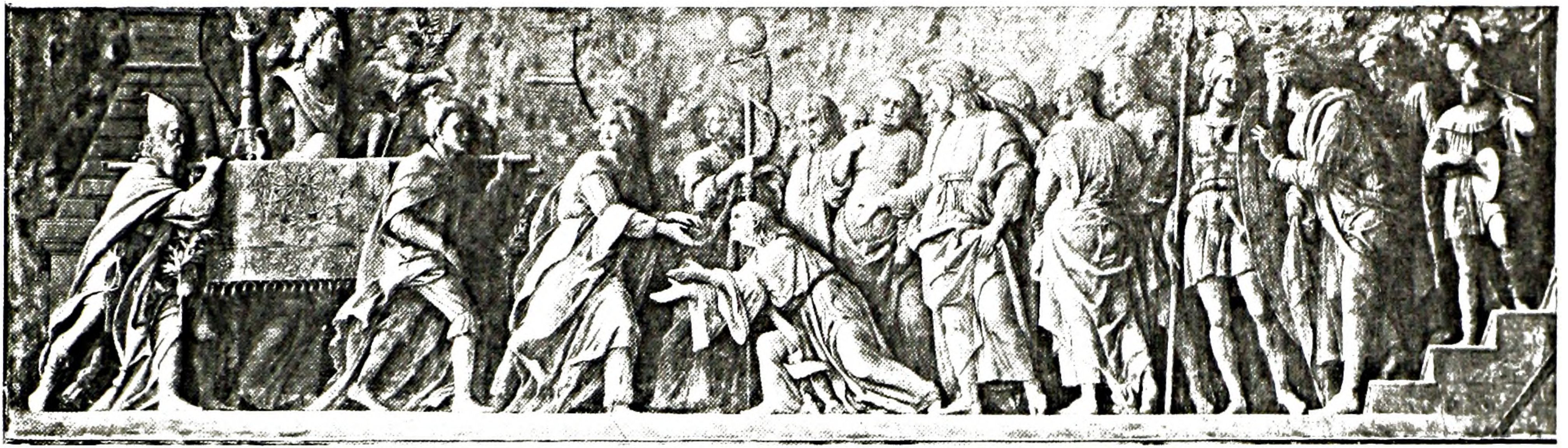
FIGURE 2. Andrea Mantegna, Scipio Acting as Host to the Phrygian Goddess Cybele. London, National Gallery.