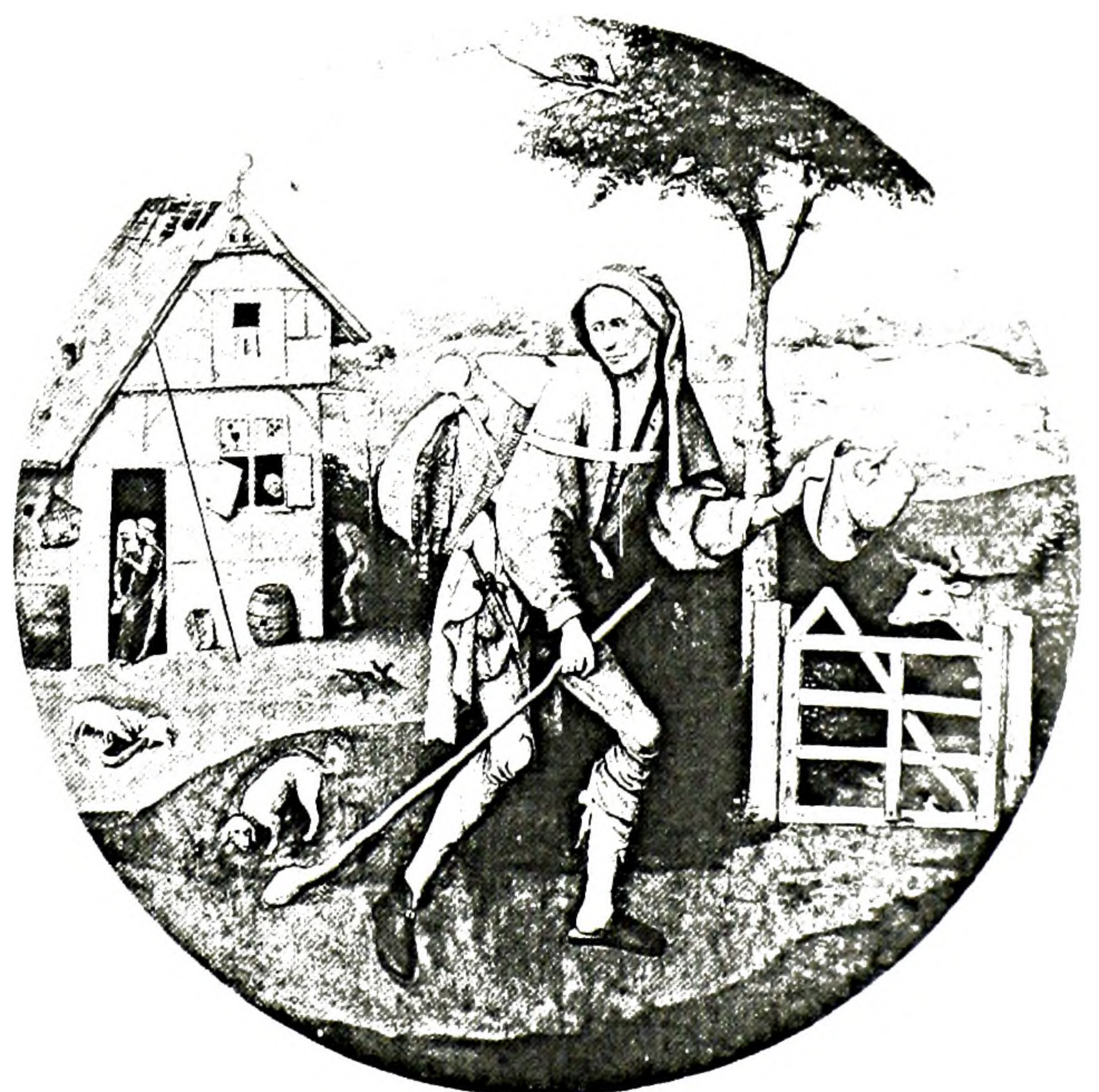
FIGURE 3. Hieronymus Bosch, The Pilgrim , ca. 1510. Rotterdam, Boymans-van Beuningen Museum.