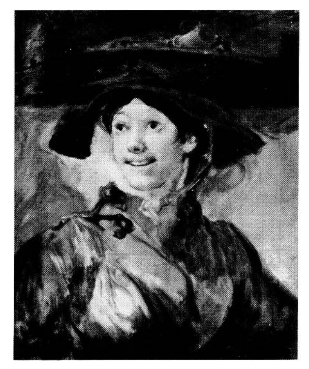
FIGURE 1. Hogarth, The Shrimp Girl. Paulson, Pl. 124.

Paulson is admirably clear. His greatest contribution to Hogarth studies is his critical catalogue Hogarth's Graphic Works (2 vols., New Haven and London, 1965; rev. ed., 1970), the indispensable reference for all future studies. His two-volume Hogarth: His Life. Art and Times (2 vols., New Haven and London, 1971) is not merely an interpreta-